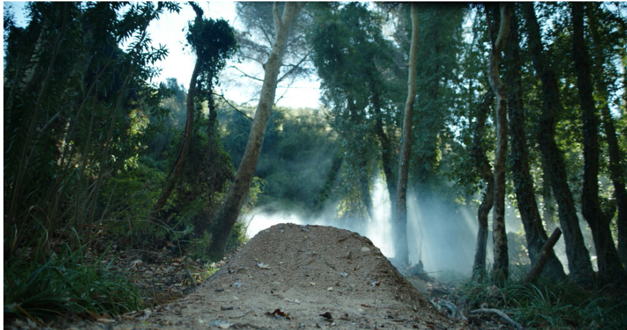
Fig. 6 Still from One emerging from a point of view , by Wu Tsang. 2019. Two-channel overlapping projections.

emigration as a myth about a neglected Berber woman who dies and is reborn as a 'deep-sea techno witch', while the other traces the experience of locals from the fishing village of Skala Sikamineas, who have helped to receive refugees escaping to their shore since 2015. Throughout the forty-five minute video, Tsang effortlessly conveys the timelessness of displacement, and the experience of the inhabitants that live with the memory of such loss. Scenes of sheep tentatively crossing a stream and being herded into a pen are used as a metaphor for the experience of refugees, while images of Yassmine dancing at the bottom of the sea surrounded by glowing sea creatures suggest a space of redemptive fantasy. Tsang balances this magical realism with a choreographic delicacy that is beautifully evoked in a single scene where the islanders heave a heavy wet rope from the shoreline at night. We never get to see what they are pulling – the next shot shows the island during the day – but it conveys the continual searching that forms the basis of Tsang's practice, an attempt to represent that which can never be fully known.