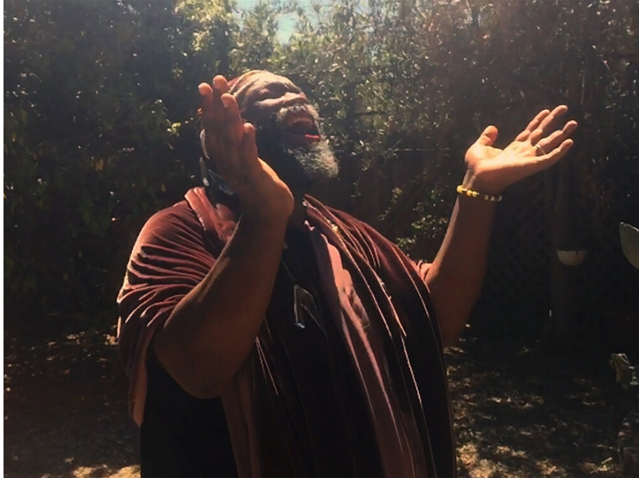
Fig. 2 Still from Girl Talk , by Wu Tsang. 2015. Single channel HD video with stereo sound.

empathy. Despite including a recording of the text that can be listened to on a record player, the overlapping, truncation and repetition of sentences mean that the piece resists easy interpretation. Drawing upon Edouard Glissant's theory of opacity as 'that which cannot be reduced', the work consciously plays with levels of transparency, which is dramatised through the fluctuations of light coming from the glass panes in the windows and doors that border the room.