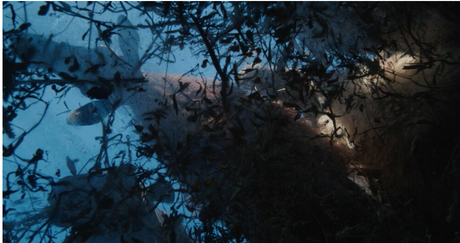
Fig. 7 Still from One emerging from a point of view , by Wu Tsang. 2019. Two-channel overlapping projections. (Courtesy the artist, Galerie Isabella Bortolozzi, Berlin, Cabinet Gallery London, and Antenna Space, Shanghai).

Wu Tsang: There is no nonviolent way to look at someone Gropius Bau, Berlin 4th September 2019–12th January 2020