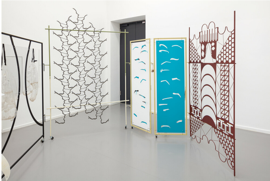
Fig. 3 Installation view of Kasia Fudakowski: Türen at Leopold-Hoesch-Museum, Düren, 2021.

wears her formidable intelligence as lightly as her hero Kaufmann wore his oversized foam cowboy hat.