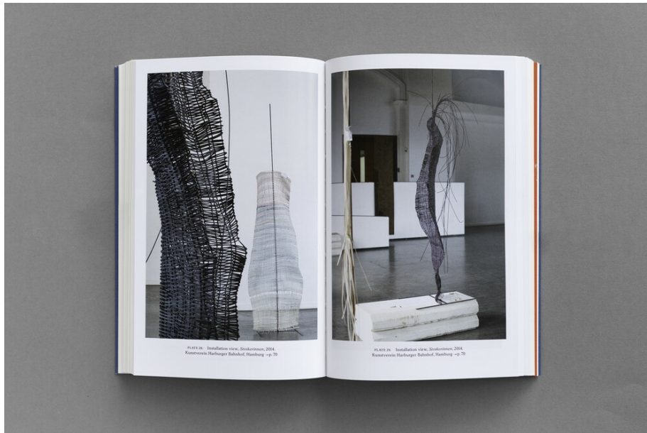
Fig. 6 From The Roll of the Artist , by Kasia Fudakowski. 2021. (Courtesy the artist and ChertLüdde, Berlin; photograph Bernd Grether).