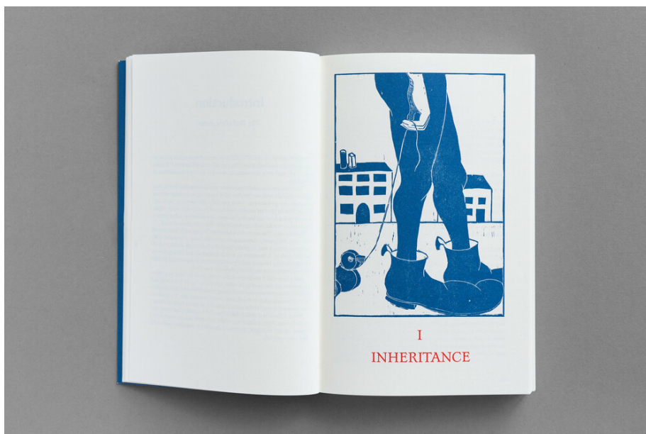
Fig. 7 From The Roll of the Artist , by Kasia Fudakowski. 2021.