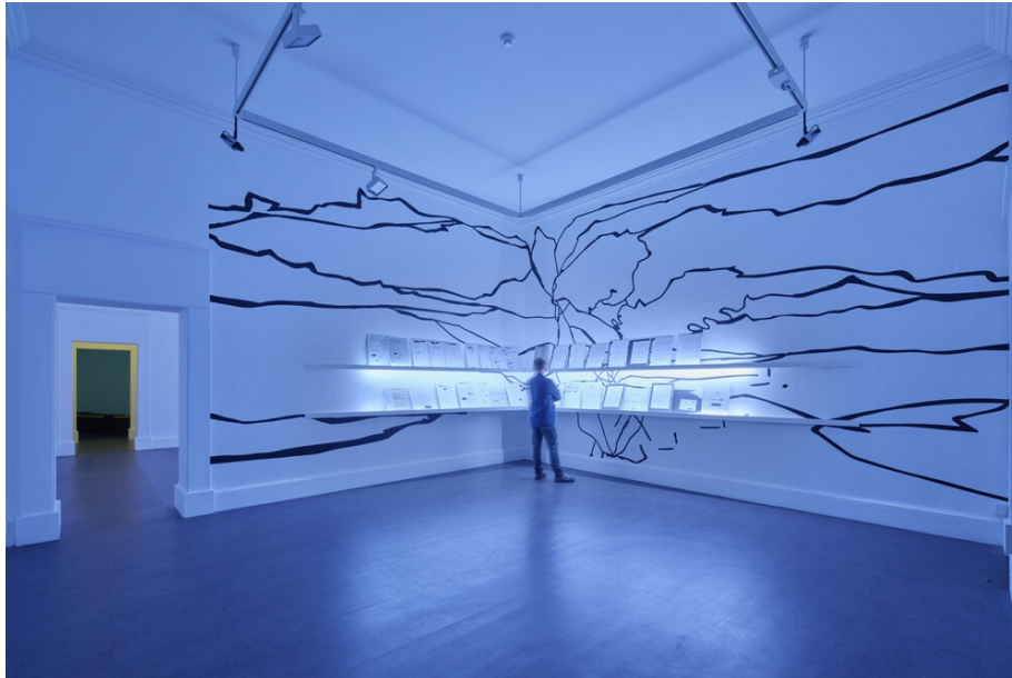
Fig. 3 Who Does the Earth Think It Is? by The Otolith Group. 2014. Scanned letters, wooden shelves and vinyl design, dimensions variable. (Courtesy the artists; photograph Ros Kavanagh; exh. Irish Museum of Modern Art, Dublin).

While the research practices and methodologies developed and applied by The Otolith Group could be compared with recent forensic approaches in artmaking, architecture and design – such as that of Forensic Architecture and Lawrence Abu Hamdan – the collective’s work is not didactic. The research they embark upon and the resulting abundance of information that emerges is not flattened, diluted or dissolved into linear frameworks or infographics, nor is it made abstract. Their work simultaneously deploys several formal approaches, which fosters dialogues with a wider audience – conversations that are often inconclusive. In this meticulously realised and seamless arrangement of works that untangle and question histories of power and oppression, the viewer is invited to interrogate how they orientate themselves in relation to selected materials, technologies, politics and ideologies. This is one of the most comprehensive exhibitions of contemporary art practice and research to be staged in Ireland, the relevance of which should not go unnoticed by viewers in neighbouring countries.