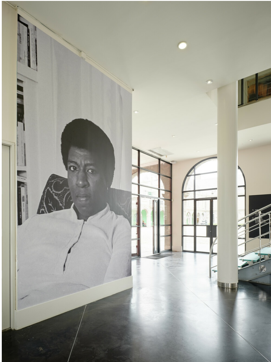
Fig. 2 Installation view of The Otolith Group: Xenogenesis at the Irish Museum of Modern Art, Dublin, 2022.

Despite the clear interrelatedness of many of the works in the exhibition, there are some that are more self-contained. For example, the feature-length video O Horizon (2018) derives from the group's longstanding interest in the work of the writer and educator Tagore, who Sagar described as 'a polymathic figure, who wanted to complicate the relationships between traditional distinctions and understandings of art and craft in the context of the British imperial education in Bengal' (p.16). O Horizon depicts the Visva Bharati school in Santiniketan, West Bengal, which was founded by Tagore in 1921. He was a vital figure in guiding India towards cultural independence and social transformation, anticipating key contemporary issues, such as the environmental crisis. Constructed using a vast montage of styles and registers of