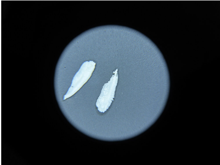
Fig. 1 Fish otoliths installed in The Otolith Group: Xenogenesis at the Irish Museum of Modern Art, Dublin, 2022. (Courtesy the artists; photograph Ros Kavanagh).

Brood ), gives the exhibition its title; the Nobel Laureate Rabindranath Tagore; and the oft-overlooked American composer and performance artist Julius Eastman. Each of these figures is referenced not only in the works but also through portrait photographs that have been enlarged and pasted onto the walls of the institution, most notably a photograph of Butler, by Patti Perret, which greets the viewer upon entering the building FIG.2 .