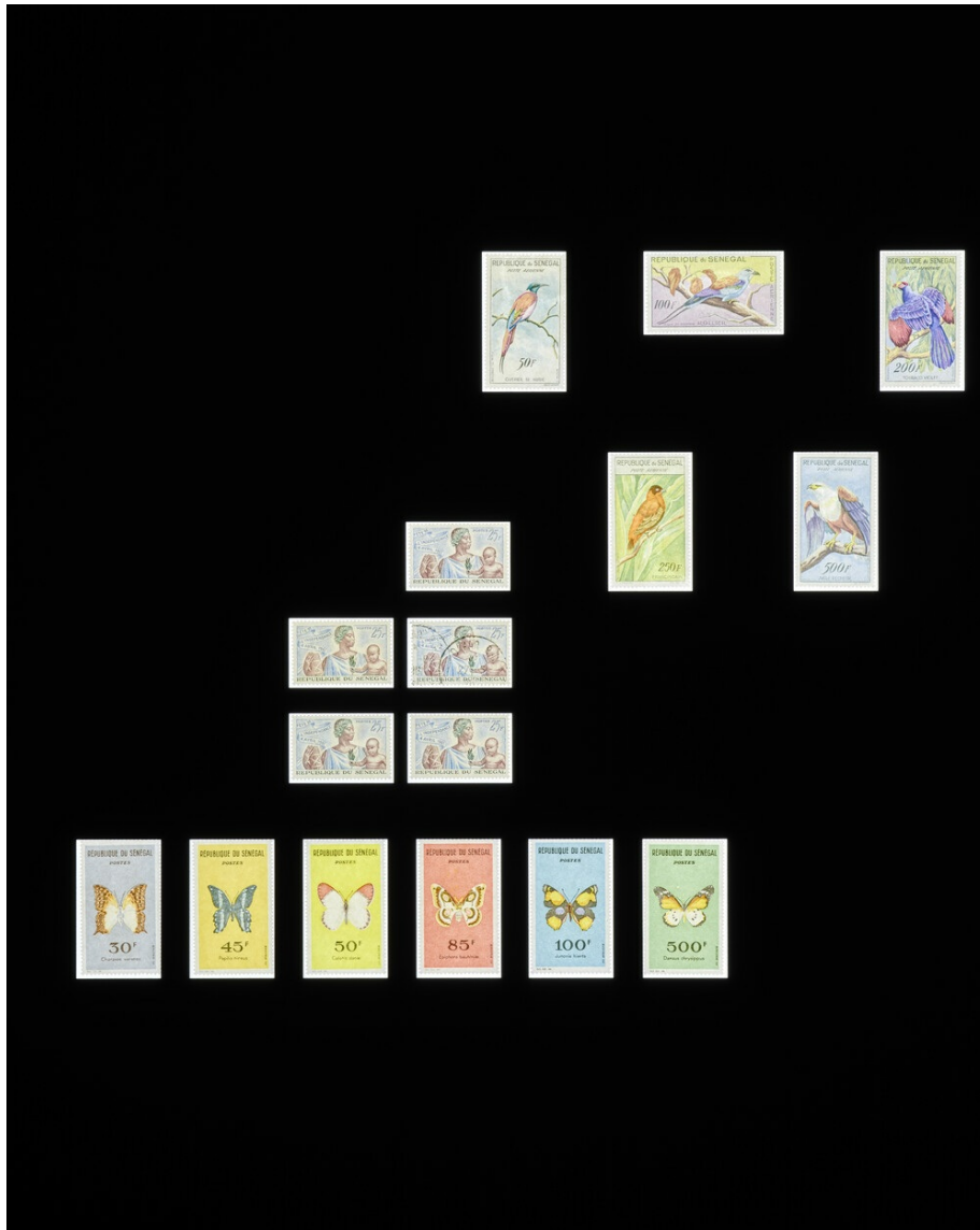
Fig. 7 Detail from Statecraft: An Incomplete Timeline of Independence Determined by Digital Auction , by The Otolith Group. 2014–19. Lightboxes, postage stamps and LED lights. (Sharjah Art Foundation Collection; exh. Irish Museum of Modern Art, Dublin).