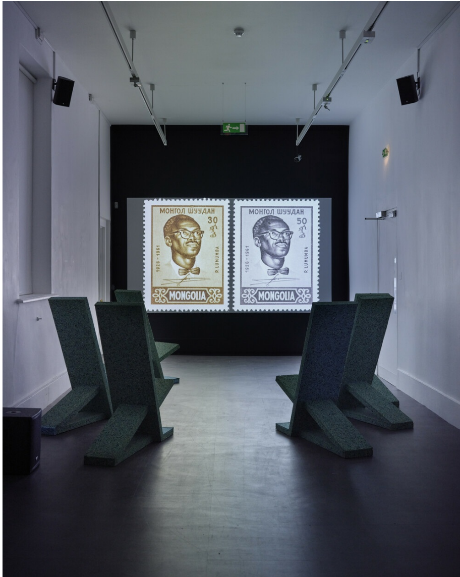
Fig. 8 In the Year of the Quiet Sun , by The Otolith Group. 2013. Video installation, duration 33 minutes and 57 seconds. (LUX, London; exh. Irish Museum of Modern Art, Dublin).