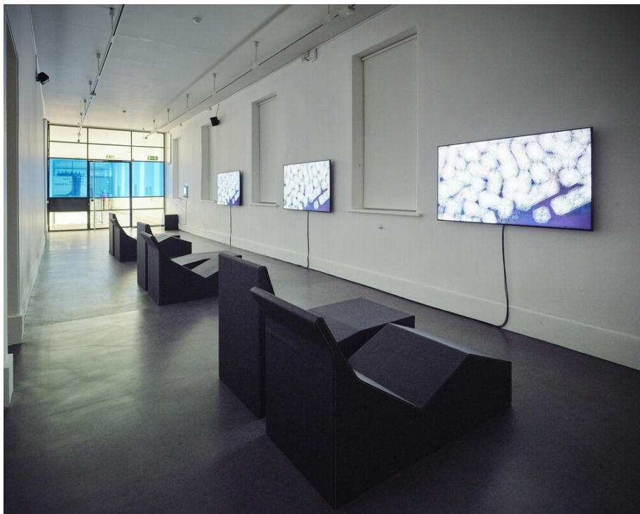
Fig. 5 Anathema , by The Otolith Group. 2011. Video installation, duration 37 minutes. (LUX, London; courtesy the artists; exh. Irish Museum of Modern Art, Dublin).