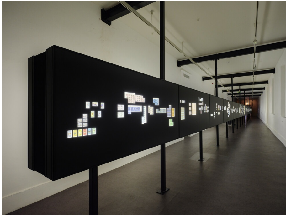
Fig. 6 Statecraft: An Incomplete Timeline of Independence Determined by Digital Auction , by The Otolith Group. 2014–19. Lightboxes, postage stamps and LED lights, 100 by 500 cm. (Sharjah Art Foundation Collection; courtesy the artists; photograph Ros Kavanagh; exh. Irish Museum of Modern Art, Dublin).