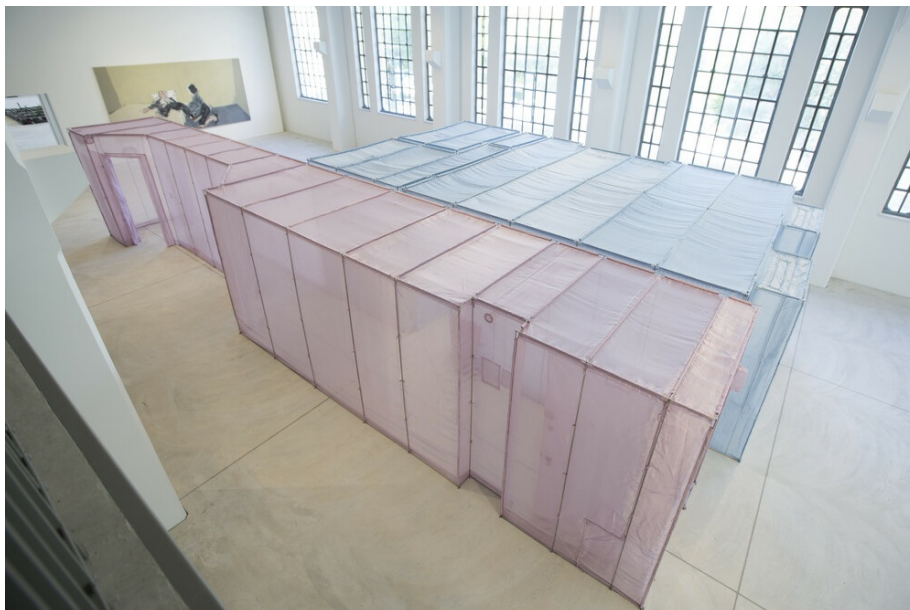
Fig. 6 348 West 22nd St., Apt. A & Corridor , New York, NY 10011, by Do Ho Suh. 2000–01. Translucent nylon, 245 by 598 by 1240 cm. (exh. former Public Tobacco Factory, Athens).