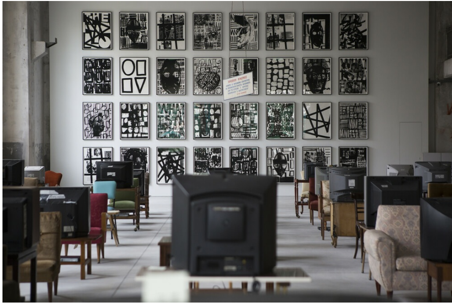
Fig. 3 Installation view of Portals , former Public Tobacco Factory, Athens, 2021, showing Our Ideas #2 , by Adam Pendleton. 2018. Silkscreen ink on Mylar, thirty-two panels, each 102.6 by 79.7 cm., overall dimensions variable.