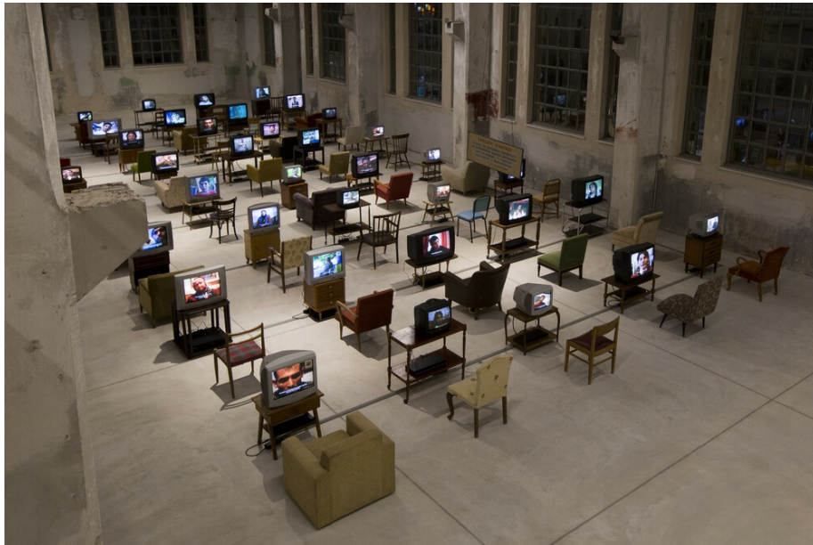
Fig. 2 Küba , by Kutluğ Ataman. 2004. Forty channel video installation with sound, forty used chairs, forty tables and forty television sets, dimensions variable. (Courtesy NEON, Athens; photograph Natalia Tsoukala; exh. former Public Tobacco Factory, Athens).

shared net of language across the gulf between meaning and interpretation. The work comprises fragments of text, taken from a 1904 poem by Constantine P. Cavafy, in multiple English translations, each echo amplifying the original.