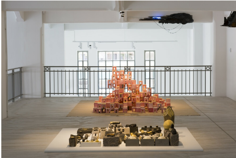
Fig. 7 Installation view of Portals , former Public Tobacco Factory, Athens, 2021, showing Fear , by Nikos Alexiou. 2003. Watercolour on paper, dimensions variable; and Interference, Noise and Message (The Parasite Series) , by Alexandros Tzannis. 2020-21. Iron, rust, magnets, neodymium magnets, glass, ceramic, bronze, neon light, iron pyrite, lepidolite, azurite, dimensions variable. (Courtesy NEON, Athens; photograph Natalia Tsoukala).