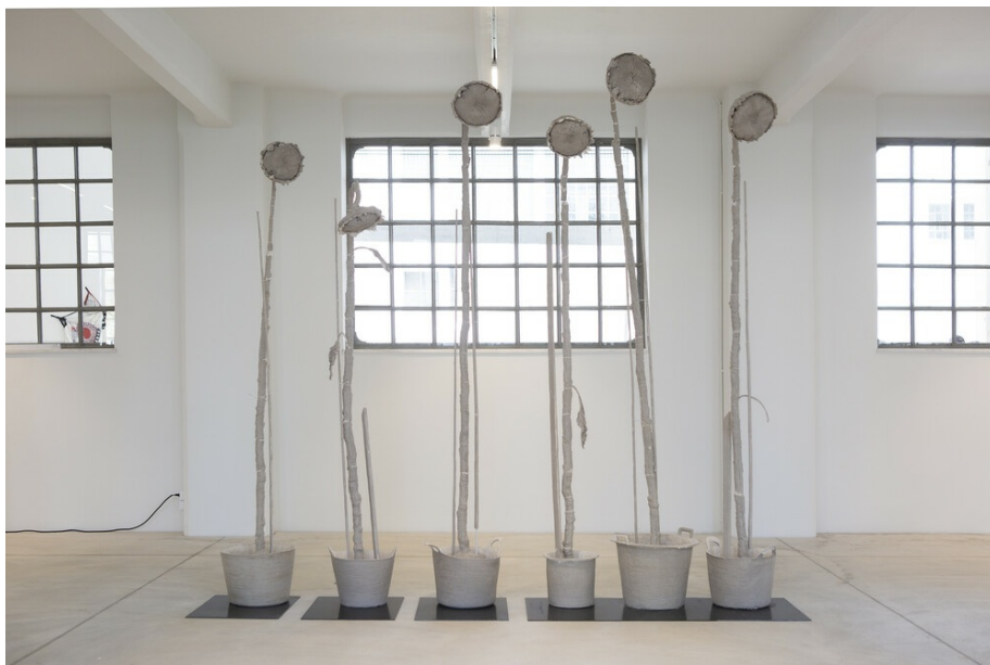
Fig. 4 Maple Row Sunflowers , by Daphne Wright. 2019. Mixed media, 310 by 300 by 60 cm. (exh. former Public Tobacco Factory, Athens).