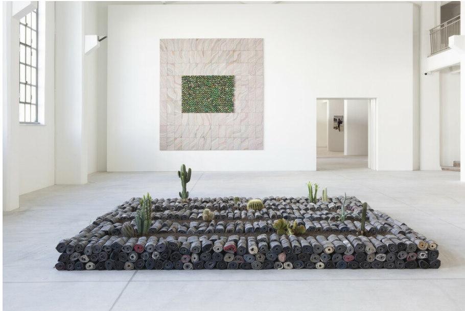
Fig. 5 Installation view of Portals , former Public Tobacco Factory, Athens, 2021, showing TIGHTROPE: ECHO!? , by Elias Sime. 2020. Reclaimed electrical wire and components, 365 by 320 by 3.2 cm. (Courtesy NEON, Athens; photograph Natalia Tsoukala).