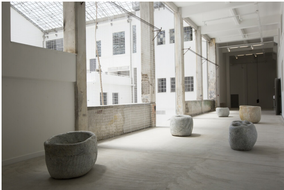
Fig. 8 Installation view of Portals , former Public Tobacco Factory, Athens, 2021, showing A Monumental Lightness , by Maria Loizidou. 2021. Cotton, linen silk threads and metal, 12.2 by 19.8 by 7.8 m. (Courtesy NEON, Athens; photograph Natalia Tsoukala).