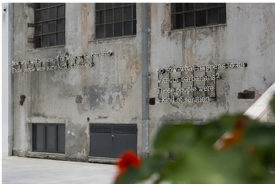
Fig. 9 Detail from Waiting for the Barbarians , by Glenn Ligon. 2021. Neon. (Courtesy NEON, Athens; photograph Natalia Tsoukala; exh. former Public Tobacco Factory, Athens).