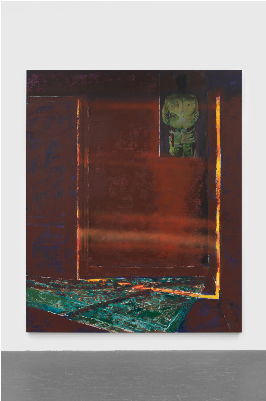
Fig. 5 Meditation Room , by Mohammed Sami. 2022. Mixed media on linen, 280 by 230 cm. (Courtesy the artist and Modern Art, London; exh. Camden Art Centre, London).

Take, for example, the painting that gives the exhibition its title, which depicts a window from inside a plane. The trope of picture-as-window has a long history, and often has embodied a liberated, empowered form of spectatorship. The world is moulded into a perspective for the viewer, who is in a position of safety and authority above it. Indeed, as a symbol of global travel, of moving up and looking down, the plane window announces Sami's liberation: it is a fresh start, The Point O FIG.6 . However, 'O' is a sign of nothingness as well as renewal. In the window, a landscape is suggested by a gradient of ochre, but this perfunctory attempt to