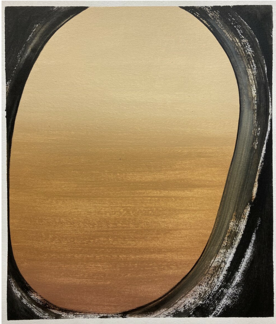
Fig. 6 The Point O , by Mohammed Sami. 2020. Acrylic on linen, 170 by 120 cm. (Courtesy the artist and Modern Art, London; exh. Camden Art Centre, London).

imply depth is betrayed by the simplicity and solidity of the paintwork. A conventional image of total vision becomes a frame without a picture – an anti-icon, flat and empty. Its blankness recalls Sami's memory of 'a perpetual sunset' created by the large amounts of sand lifted into the air around Baghdad as a result of the invasion, during which troops destroyed the city's natural shield of trees against the surrounding desert. 8