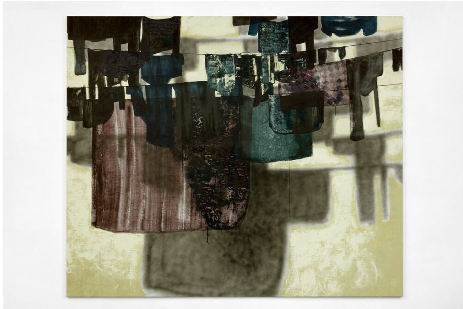
Fig. 3 The Weeping Lines , by Mohammed Sami. 2022. Mixed media on linen, 291 by 343 cm. (Courtesy the artist and Modern Art, London; exh. Camden Art Centre, London).

the peace even in this isolated, windowless setting – a room for prayer according to the title. Luc Tuymans (b.1958) once advised Sami to ‘paint the sound of the bullet, not the bullet’ itself, but in the younger artist’s hands this distinction is unstable. 5 Images, shadows and reflections appear more forceful than the physical things that precede them.