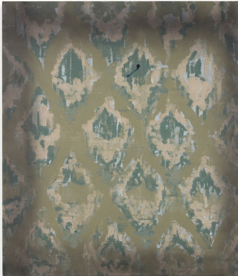
Fig. 7 Weeping Walls III , by Mohammed Sami. 2022. Mixed media on linen, 75.5 by 65 cm. (Courtesy the artist and Modern Art, London; exh. Camden Art Centre, London).

cover the blank space with something new. Instead, he draws strength from a state of in-betweenness and evades the image-war. Rather than rejecting Saddam's propaganda for a false dream of freedom, he asks us to linger here, at 'the point O' and wait for the dust to settle.