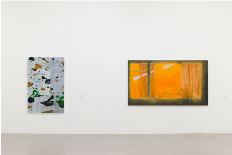
Fig. 4 Installation view of Mohammed Sami: The Point Oat Camden Art Centre, London, 2023, showing, on the left, Father Figure I . 2019. Acrylic on linen, 160 by 105 cm. (Courtesy the artist and Modern Art, London).

The response to Sami's exhibition has thus far tended to focus on his oppression under the Saddam regime, often without mention of the 2003 invasion of Iraq. 7 This emphasis – bolstered by frequent reference to his rise from the prescribed imagery of a propaganda painter to the expressive freedom of an international artist – implies a simplistic narrative of the artist's escape from the 'authoritarian Middle East' to the 'liberated West'. It is unfortunate that Abu Ghraib (2022), Sami's shadowy rendition of the notorious 'hooded man' photograph of an Iraqi torture victim in the United States military prison, is not included in the show, as it would have made plain the complicity of Western nations in the violence on display. Even his less explicit works, however, resist such reductive narratives.