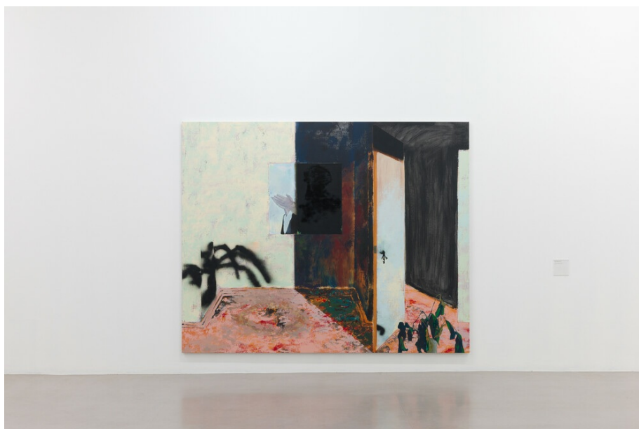
Fig. 1 The Praying Room , by Mohammed Sami. 2021. Mixed media on linen, 230 by 285 cm. (Courtesy the artist and Modern Art, London; exh. Camden Art

Born in Baghdad, Sami grew up under Saddam Hussein's government and entered adulthood in the shadow of the United-States-led invasion of Iraq in 2003. He was granted asylum by Sweden in 2007, where he spent nine months in a refugee camp, and now lives in London. The impact of this tumultuous youth echoes throughout Sami's recent canvases, which are on display in his first institutional solo exhibition in the United Kingdom, at Camden Art Centre, London FIG.2 . 1 Commonplace objects become sinister spectres in the desolate ruins he paints FIG.3 , as memories of a violent past disrupt the relative safety of the present.