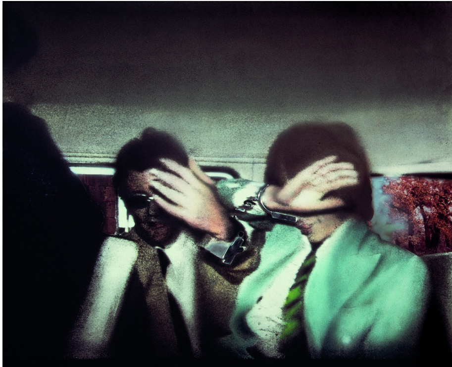
Fig. 5 Swingeing London 67 (f) from the series Swingeing London 67 , by Richard Hamilton. 1968–69. Screen print on canvas, acrylic and collage, 67 by 85 cm.