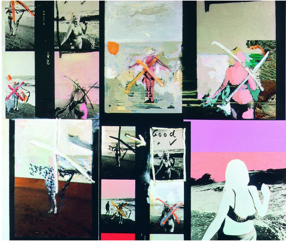
Fig. 3 My Marilyn , by Richard Hamilton. 1965. Oil and collage on photograph on panel, 102.5 by 122 cm. (© Estate of Richard Hamilton; Museum Moderner Kunst, Munich, on loan from Österreichische Ludwig-Stiftung).

Modern World is as much a portrait of Hamilton's spirit of inquiry, attitude and iconoclastic approach to creativity as it is a series of close readings of individual works. Refreshingly, Bracewell has selected works not according to a rigid temporal or formal structure, but instead in response to the fluidity of aesthetic association or to the prevailing cultural amnion that might have bound certain pieces together – for example, the series Swinging London 67 FIG.5, depicting Mick Jagger, and Hamilton's design for The Beatles's 'White Album' (1968). This is where Bracewell's all-embracing range of cultural concerns, especially his fluency in pop music, most serves his subject FIG.6. Memorable passages include his description of the 'acoustic dead drops and sudden silences [. . .] the tinkling, icicle chime meanderings of a ghostly saloon-bar piano' (p.22) of Elvis Presley's Heartbreak Hotel to elaborate the sense of alienation that prevails in My Marilyn , or his analysis of the 'formulaic house style of psychedelic/underground graphics' (p.151) as a foil to the radicality of Hamilton's utterly blank design for the 'White Album'.