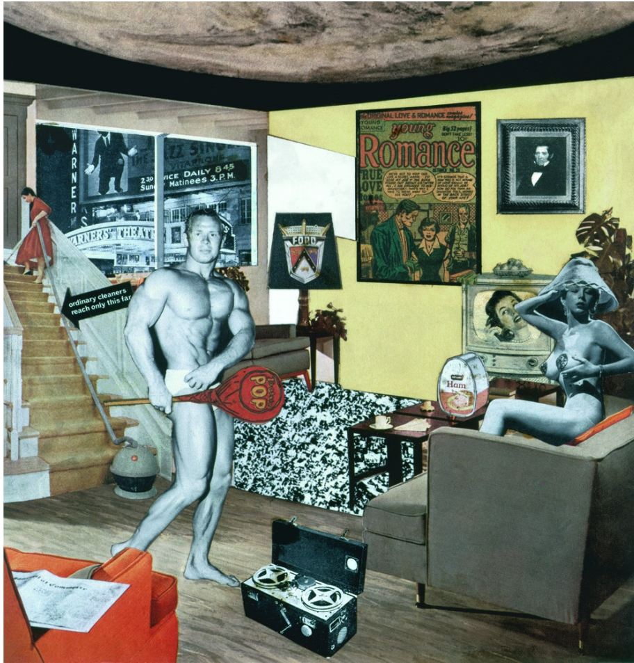
Fig. 2 Just what is it that makes today's homes so different, so appealing? by Richard Hamilton. 1956. Collage, 26 by 25 cm. (© Estate of Richard Hamilton).

At times Bracewell pauses to reflect on lesser-known works, such as Hamilton's Study for 'Lux 50' series, which was originally commissioned in 1973 by the Japanese Lux Corporation. The studies depict a black Lux amplifier positioned on a white table against softly hued, airbrushed backgrounds, prefiguring Hamilton's technological literacy and obsessive use of computer programs from 1987 onwards. Bracewell highlights this series for its demonstration of how 'research, experimentation, and process are the basis of Hamilton's approach to making art', going on to suggest that 'process and technology [. . .] comment upon themselves and their subject simultaneously. This critique can be ironical, sociological, political, and aesthetic – and often all of these positions, seamlessly melded, comment upon one another' (p.82). This is, in a sense, a good summary of Hamilton's oeuvre, given that the artist's declared ambition was 'to be multi-allusive! [. . .] to relate to everything that was going on in the world' (p.42), while at the same time striving to reconcile his painterly sensibility and technologist's appetite for innovation FIG.4.