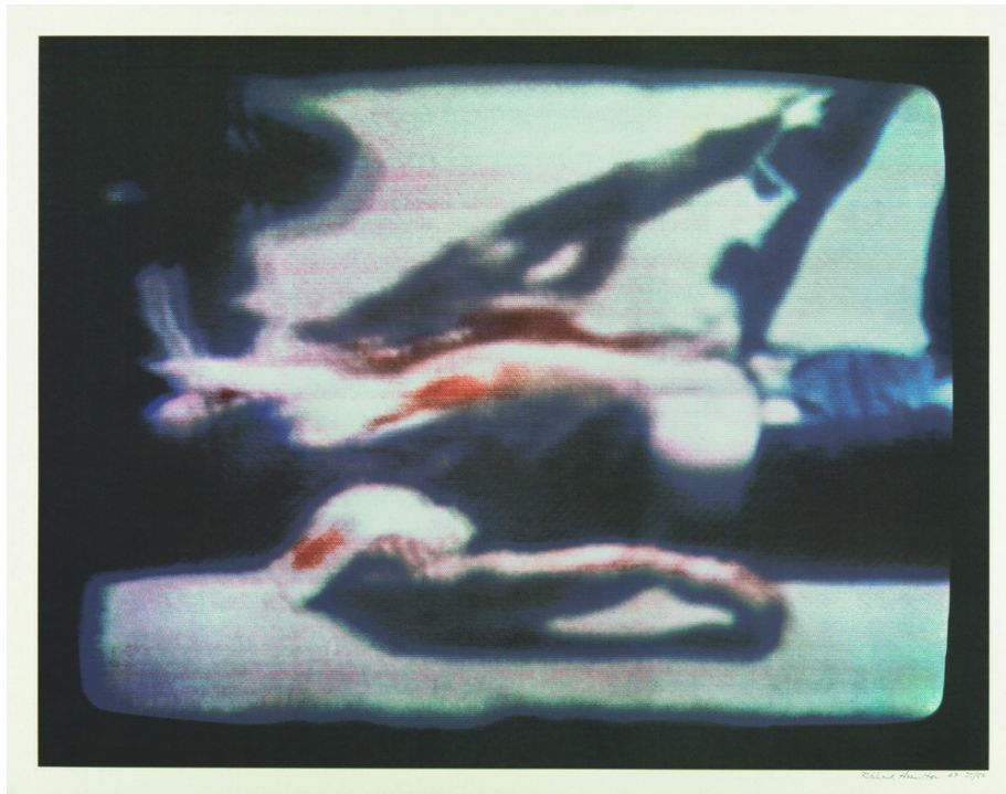
Fig. 7 Kent State , by Richard Hamilton. 1970. Screen print from thirteen stencils, 73 by 102.2 cm. (© Estate of Richard Hamilton).