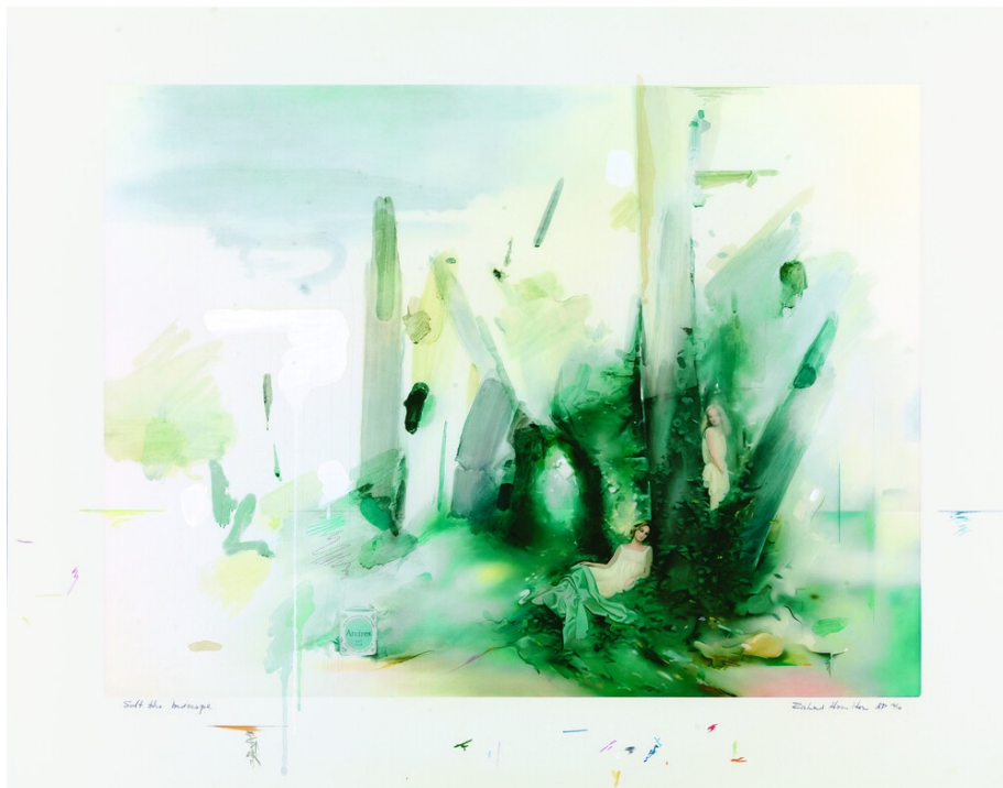
Fig. 4 Soft blue landscape , by Richard Hamilton. 1979. Collotype in seven colours and screen print from approximately ten stencils in forty colours, 73 by 91.8 cm. (© Estate of Richard Hamilton).

work, in some respects, consolidated Hamilton's concerns. Bracewell writes: 'The interconnectedness and internal mirroring of the image, subject, process, comment, and viewing that Hamilton achieves with Kent State could not be more symmetrical. The human significance of the subject is rendered multi-allusive to the viewer by the artistic and technical processes of its depiction and replication. This simultaneously passes moral, ironic, or merely lucid comment on the means by which the source image of the subject was both created and received' (p.144). The human significance of Hamilton's work is one thing, it is the depth that gives his oeuvre lasting value, but Modern World gives us something else: the human at the easel – or, in later years, at the computer monitor – and a rare opportunity to look at something and see it genuinely afresh.