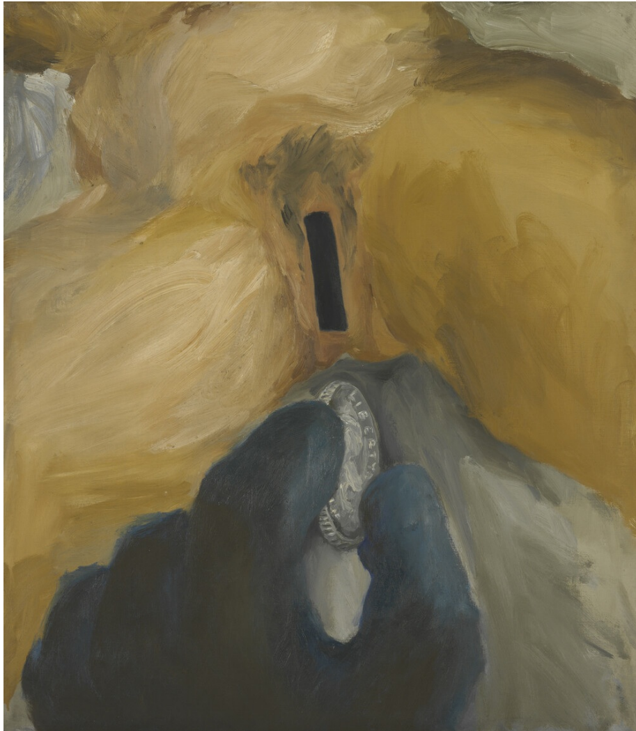
Fig. 3 No title , by Lee Lozano. 1962. Oil on canvas, 83.8 by 73.7 cm. (© Estate of Lee Lozano; private collection; courtesy Hauser & Wirth Collection Services; exh. Pinacoteca Agnelli, Turin).

experiment in art not to be exhibited: 'Call, write or speak to people you might not otherwise see for the specific purpose of inviting them to your loft for a dialogue'. Dropout Piece (1970), on the other hand, appeared to be an attempt to dissolve the self altogether, through 'diminished consumption: of calories, cigs, dope; of joyous energy (like dancing), emotions, intensity; of restlessness, ambition, work'. In an untitled piece from 1971, she declared: 'I have no identity [...] I will make myself empty to receive cosmic info. I will renounce the artist's ego'.