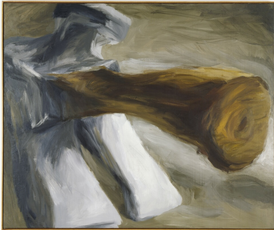
Fig. 4 No title , by Lee Lozano. c.1962. Oil on canvas, 126 by 150 by 1.8 cm. (© Estate of Lee Lozano; private collection; courtesy Hauser & Wirth Collection Services; exh. Pinacoteca Agnelli, Turin).

another painting or drawing again. Her final act of erasure was choosing to be buried in an unmarked grave. For an artist as fascinating and enigmatic as Lozano, it is perhaps impossible for a retrospective to fill in all the gaps. Strike delivers a persuasive if partial overview of Lozano's mission: using one's life to make art as absolute and irresolvable as life itself. In Bruce Hainley's astute analysis, Lozano was, finally, 'not misogynist or misanthropic, not even transhuman, but sheer trans , beyond dematerialization'. 4 This brings to mind Lozano's early self-portraits in charcoal FIG.7 : her curious, undaunted stare, the outlines of her face half-rubbed out. Here and not there; there and not here.