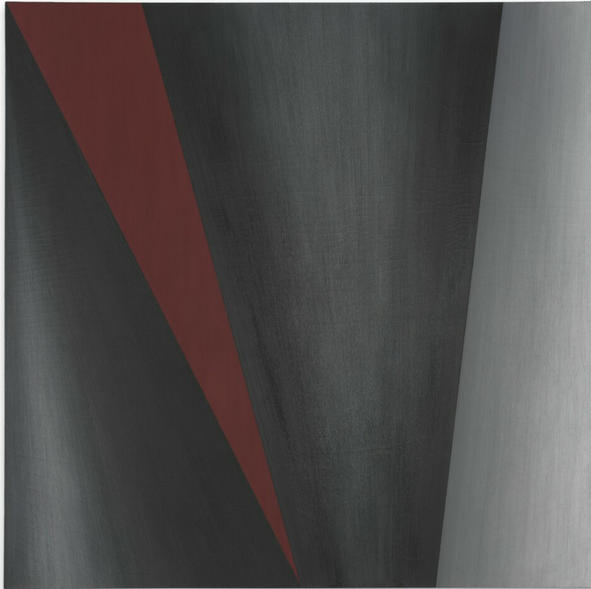
Fig. 6 Cram , by Lee Lozano. 1965. Oil on canvas, 198.1 by 198.1 by 3.8 cm. (© Estate of Lee Lozano; courtesy Hauser & Wirth; photograph Barbora Gerny; exh. Pinacoteca Agnelli, Turin).