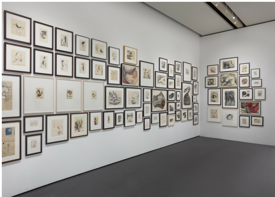
Fig. 2 Installation view of Lee Lozano: Strike at Pinacoteca Agnelli, Turin, 2023. (Photograph Sebastiano Pellion Di Persano).

project: what does it mean to refuse the terms of a pre-existing system? In one drawing, a tube of paint is squeezed into a businessman's hand, 'bullshit' angrily crayoned above. No title (ass kisser) FIG.5 lands another blow to the sycophancy of the institutionalised art scene: a smoking man in a suit finds his head transformed into a pair of buttocks. In another work, a penis is mangled inside a typewriter, the keys of which have been re-labelled 'no', 'work', 'think', 'mutha', 'shit', 'cunt' and 'off'. Lozano's furious communication becomes another form of protest: turning words into visual action against anything that mechanises or deadens, including the rules of language itself.