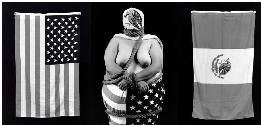
Fig. 4 Three Eagles Flying , by Laura Aguilar. 1990. Three gelatin silver prints, each 70 by 51 cm. (© Laura Aguilar; courtesy Whitney Museum of American Art, New York; exh. Leslie-Lohman Museum of Art, New York).

Not only does this exhibition give long-overdue recognition to an artist whose work deserves more critical attention, it also comprehensively explores the wide variety of themes in Aguilar’s oeuvre, all of which are pertinent to our current moment. Since the beginning of the pandemic, increased isolation has caused a rise in mental illness, substance abuse and suicidal ideation; the global shift toward remote working has brought attention to issues of workplace accessibility and the need for online accommodation practices. Aguilar’s work remains relevant and radical, serving as a testament to her lasting legacy. It invites viewers to take a critical look at our contemporary state and to recognise issues that continue to persist while simultaneously encouraging us to dream of a more caring and accessible future for all.