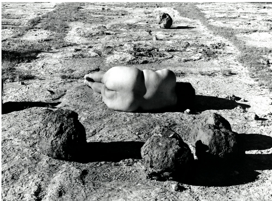
Fig. 8 Nature Self-Portrait #2 , by Laura Aguilar. 1996. Gelatin silver print, 40.6 by 50.1 cm (© Laura Aguilar; courtesy Vincent Price Art Museum Foundation, Los Angeles and the Los Angeles County Museum of Art, Los Angeles; exh. Leslie-Lohman Museum of Art, New York).