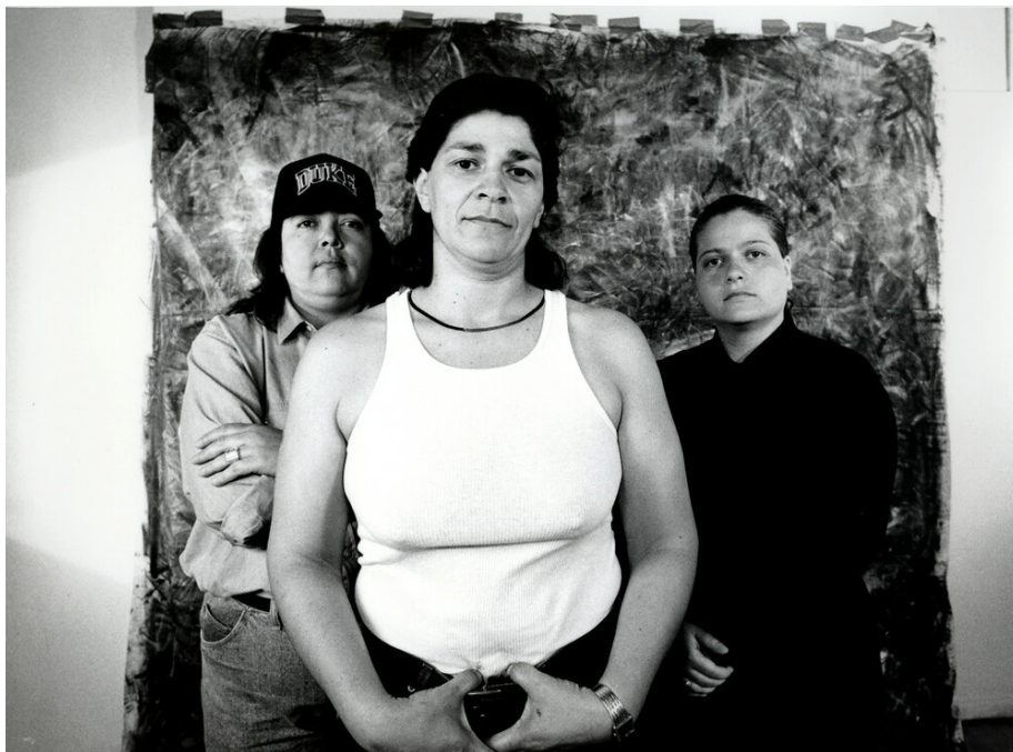
Fig. 6 Plush Pony #2 , by Laura Aguilar. 1992. Gelatin silver print, 27.9 by 35.6 cm. (© Laura Aguilar; courtesy Vincent Price Art Museum Foundation, Los Angeles and the Los Angeles County Museum of Art, Los Angeles; exh. Leslie-Lohman Museum of Art, New York).