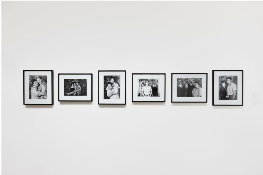
Fig. 5 Installation view of Laura Aguilar: Show and Tell at Leslie-Lohman Museum of Art, New York, 2021.