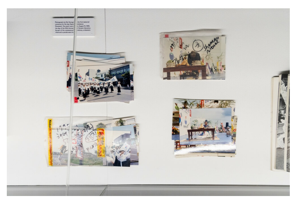
Fig. 7 Installation view of Jane Jin Kaisen: Halmang at esea contemporary, Manchester, 2024, showing detail of archive table.