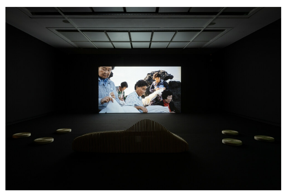
Fig. 4 Installation view of Jane Jin Kaisen: Halmang at esea contemporary, Manchester, 2024.

Halmang seeks to make parallels across not only histories, but also geographies. Xiaowen Zhu, the Director of esea contemporary, frames Kaisen's practice through 'the interconnectedness of our shared human experience'. According to the exhibition wall text, this is uniquely revealed through its presentation in a building that was once part of Manchester's Victorian fish market. Halmang not only aligns with the organisation's mission to profile artistic practises informed by East and Southeast Asian backgrounds and their diasporas, it also seeks to draw spatio-temporal relationships between Jeju Island and the United Kingdom through the histories of aquaculture. However, the ways in which these locations are linked is not contextualised beyond the historic use of the esea contemporary building. As the film is exhibited in a conventional darkened environment, this history is also not immediately apparent to the visitor. Therefore, these correlations operate most effectively on a more conceptual level, with the entanglement of the sochang and the landscape representing the ingrained relationships between people, memory and geography. Through the legacies of colonialisation and modernisation, one can trace imagined lines of connection between Victorian Manchester and the devastating impact of industrialised fishing on the h\alpha enyeo.