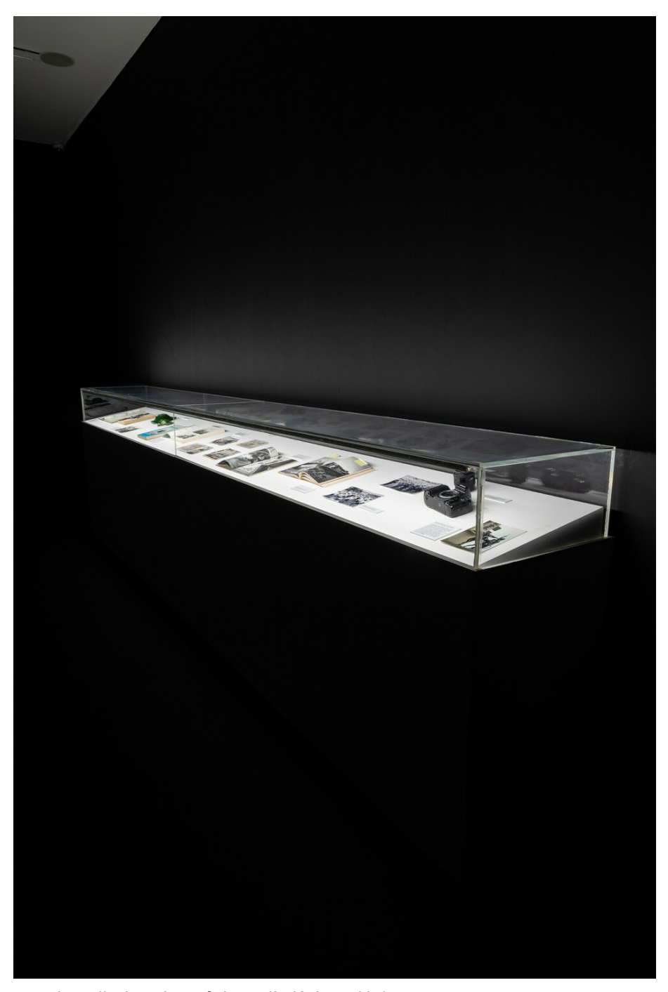
Fig. 5 Installation view of Jane Jin Kaisen: Halmang at esea contemporary, Manchester, 2024.