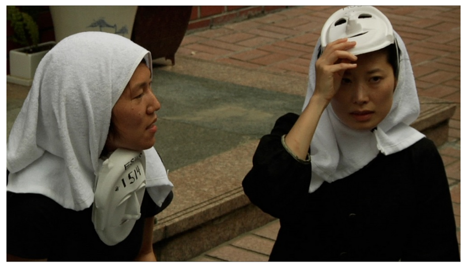
Fig. 10 Still from The Woman, The Orphan, and The Tiger , by Jane Jin Kaisen and Guston Sondin-Kung. 2010. Film, duration 72 minutes. (Courtesy the artists; exh. esea contemporary, Manchester).