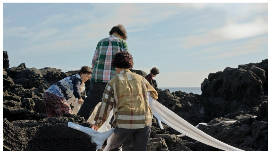
Fig. 2 Still from Halmang, by Jane Jin Kaisen. 2023. Film, duration 12 minutes 2 seconds. (Courtesy the artist; exh. esea contemporary, Manchester).

Kaisen has also returned to Jeju Island to confront its Cold War history, which is frequently framed in her practice through issues of memory, colonisation, modernisation and migration. The relationship between the h\alpha enyeo tradition and the political history of the island is also explored in two earlier moving image works, which are exhibited in the gallery's communal project space FIG.8. In Of the Seα FIG.9 Kaisen reflects upon her grandparents' involvement in the resistance movement. The artist walks along the black lava shore, carrying items used for diving as well as her grandfather's book Annals of the Jeju Haenyeo's Anti-Japanese Resistance, which was published in 1995. The Woman, The Orphan, and The Tiger FIG.10 follows a group of transnational adoptees and other women of the Korean diaspora, exploring transgenerational trauma through oral histories, interviews, public statements and poetry. Although these films are exhibited separately from Halmang, provocative connections can be made with the titular work, as Kaisen focuses on the legacies of conflict embedded in the landscape from which the h\alpha enyeo still depart into the sea.