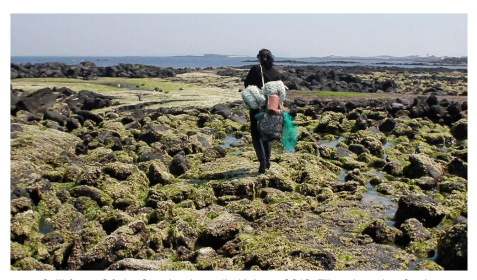
Fig. 9 Still from Of\ the\ Sea , by Jane Jin Kaisen. 2013. Film, duration 2 minutes 15 seconds. (Courtesy the artist; exh. esea contemporary, Manchester).