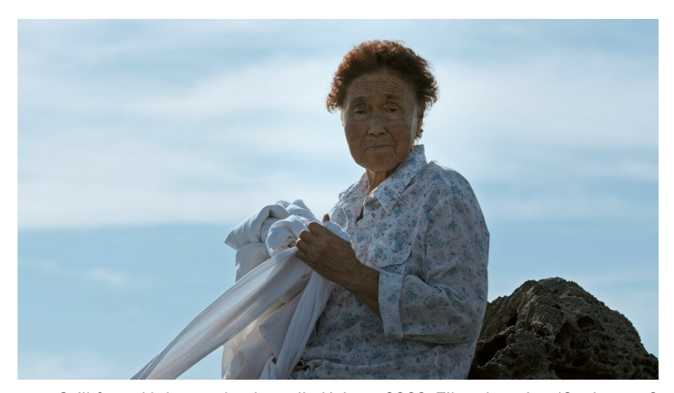
Fig. 1 Still from Halmang , by Jane Jin Kaisen. 2023. Film, duration 12 minutes 2 seconds. (Courtesy the artist; exh. esea contemporary, Manchester).

occupational forces. Photographs and objects collected by Kaisen also explore how the resistance was commemorated Fig.7 after Korea's liberation in 1945, including shamanic rituals, parades and the establishment of monuments. These materials outline the crucial role of the h\alpha enyeo in this period, but they also contextualise a collective history of Jeju Island – one that exists within the landscape so affectingly captured by Kaisen.