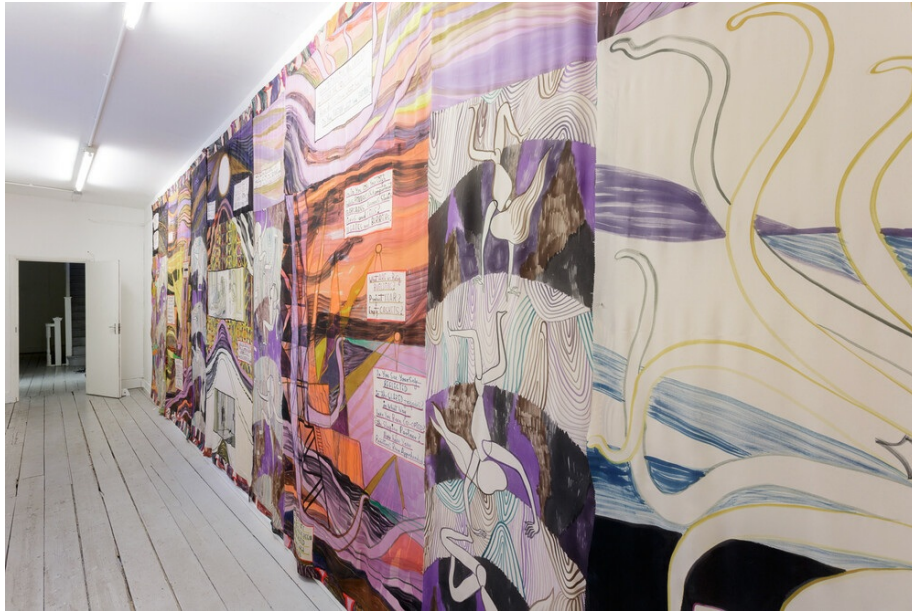
Fig. 1 Installation view of Do you keep thinking there must be another way at Mimosa House, London, 2019, showing 21st Century Sleepwalk , by Emma Talbot. (Courtesy the artist and Galerie Onrust, Amsterdam, and Galerie Petra Rinck, Düsseldorf; photograph Tim Bowditch).