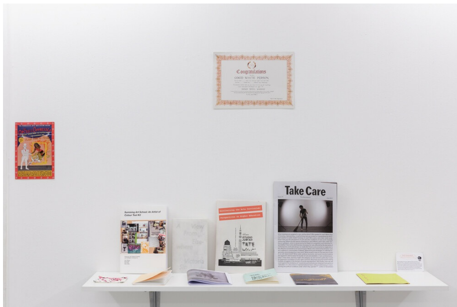
Fig. 5 Installation view of Do you keep thinking there must be another way at Mimosa House, London, 2019, showing Under/Valued Energetic Economy , by Raju Rage. 2017–ongoing. (Courtesy the artist; photograph Tim Bowditch).