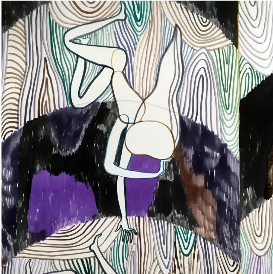
Fig. 2 Detail of 21st Century Sleepwalk , by Emma Talbot. 2018. (Courtesy the artist, Galerie Onrust, Amsterdam, and Galerie Petra Rinck, Düsseldorf; photograph Tim Bowditch).

The expectation that artists perform versions of themselves on demand is challenged in Georgia Sagri's Documentary of Behavioural Currencies / Georgia Sagri as GEORGIA SAGRI (still without being paid as an actress) (2016). We see the artist attempting to renegotiate her contract with Manifesta 11, which includes the stipulation that she is filmed for a documentary for no additional pay or creative credit. 'It's about artistic integrity', she explains to the baffled biennial staff, whose faces and voices are rendered anonymous. 'This is my content and my intellect, acting the artist'. Alongside the original Manifesta contract, Sagri presents her two proposed (unaccepted) alternatives. Both acknowledge and remunerate her labour, in one as an 'actress', in the other an 'artist'.