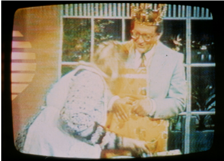
Fig. 6 Still from MADRE POR UN DIA II, by Polvo de Gallina Negra. 1987. Television broadcast. Nuestro Mundo, presented by Guillermo Ochoa (exh. Mimosa House, London).