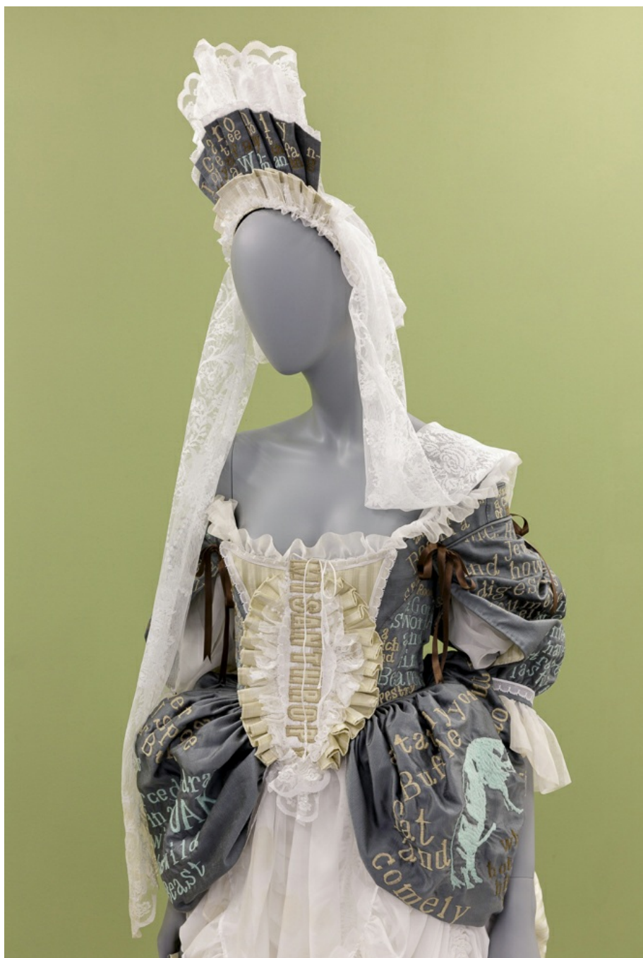
Fig. 7 Installation view of Do you keep thinking there must be another way at Mimosa House, London, 2019, showing a detail of Costumes for 'The Whore's Rhetorick' , by Georgia Horgan, 2018–19.