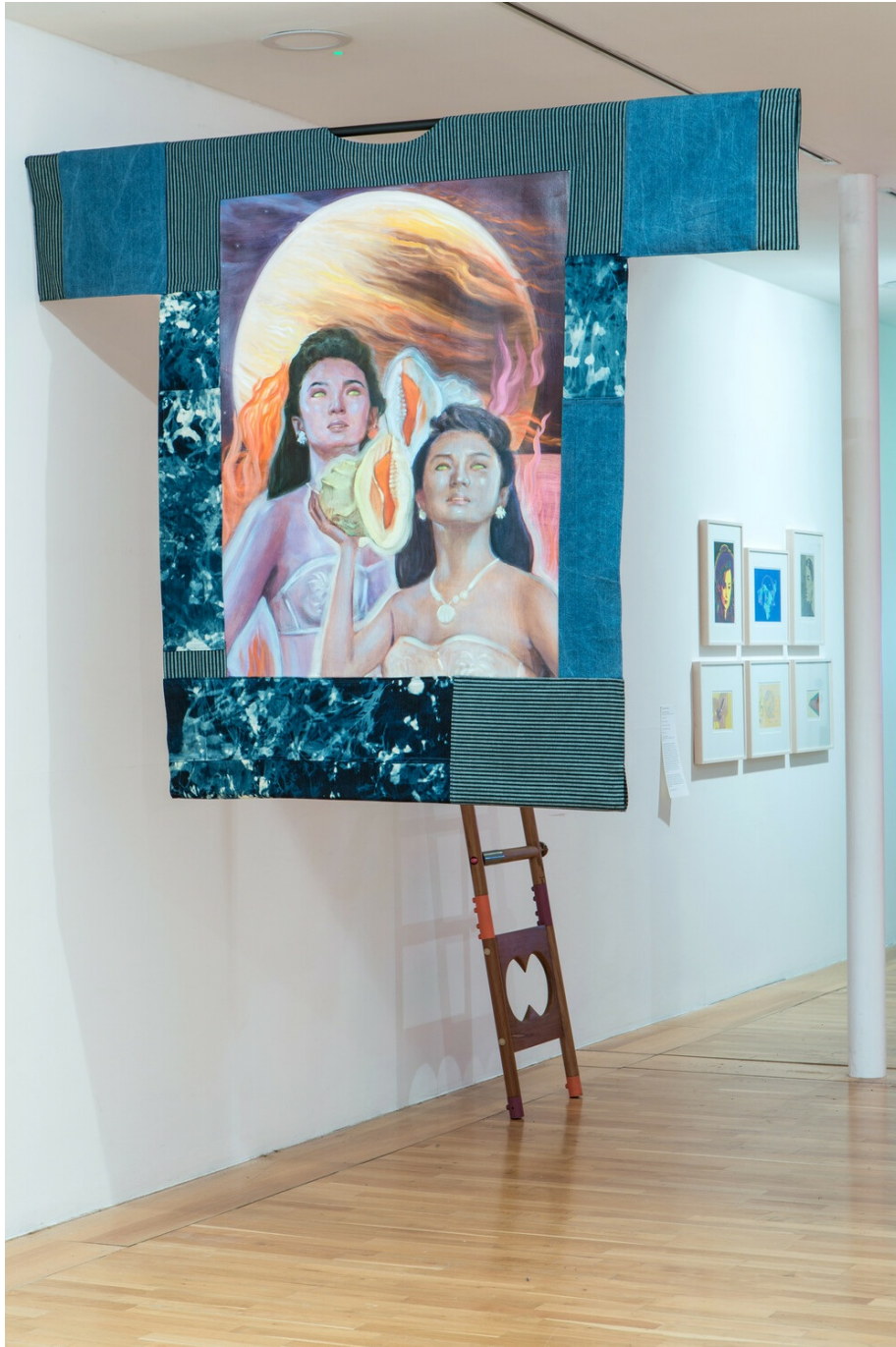
Fig. 6 Installation view of Still I Rise: Feminisms, Gender, Resistance at the De La Warr Pavilion, Bexhill-on-Sea, 2019, showing Call Waiting (2018) by Zadie Xa.