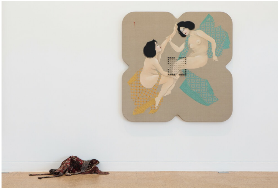
Fig. 2 Installation view of Hayv Kahraman: Displaced Choreographies at the De La Warr Pavilion, Bexhill-on-Sea, 2019.

Still / Rise is a historical exhibition, from its content to its concept. While many of the artists included seem to have their heads turned to the past, they are also looking forward. The curators are similarly Janus-faced, able to assert the importance of past work for the present and the future. The success of these exhibitions does not lie in the creation of an important or influential exhibition, but in the undoing of these values in favour of disorderly constellations that nonetheless settle into significance.