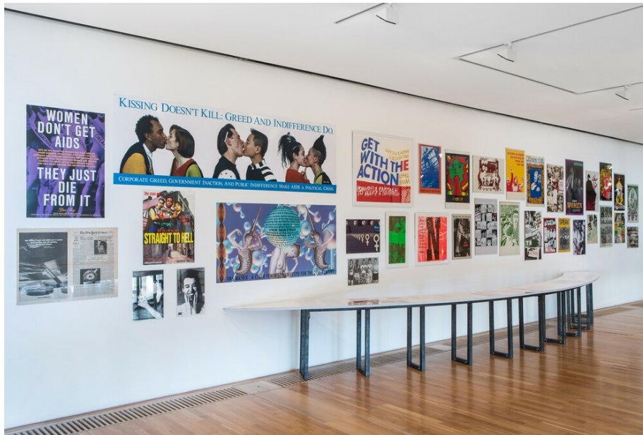
Fig. 5 Installation view of Still I Rise: Feminisms, Gender, Resistance at the De La Warr Pavilion, Bexhill-on-Sea, 2019. (Photograph Rob Harris).