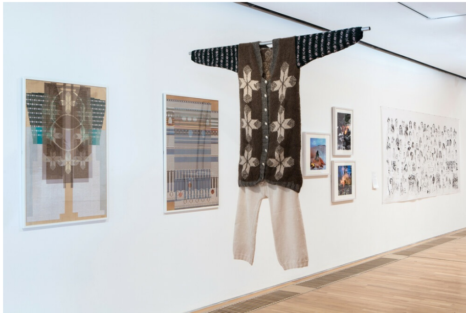
Fig. 8 Installation view of Still I Rise: Feminisms, Gender, Resistance at the De La Warr Pavilion, Bexhill-on-Sea, 2019. (Photograph Rob Harris).