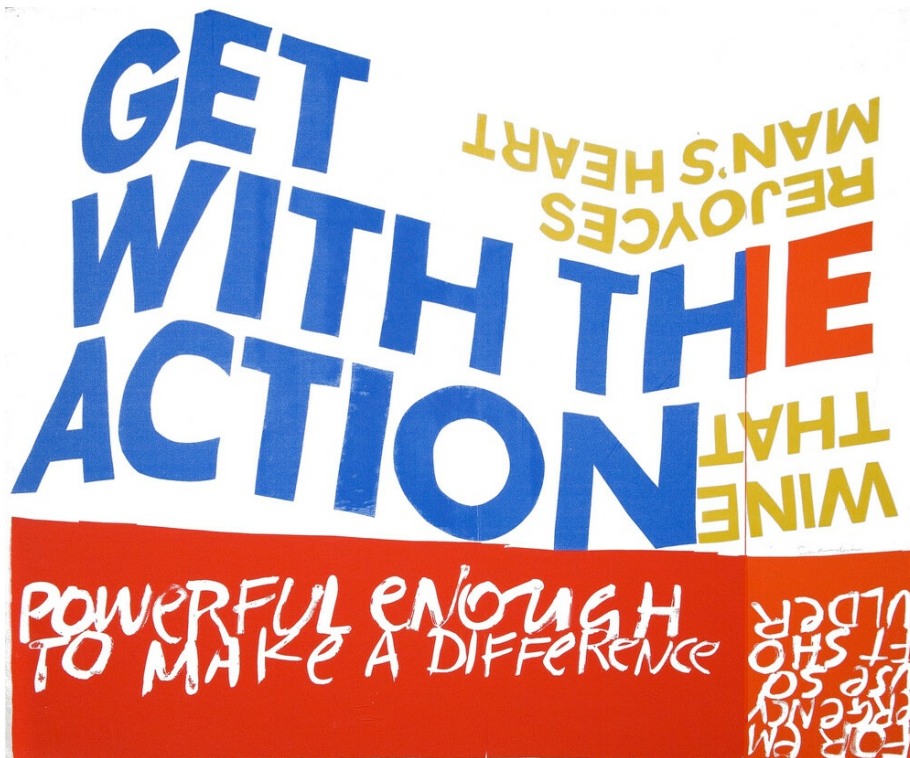
Fig. 4 For emergency use soft shoulder , by Corita Kent. 1966. Screenprint, 76.2 by 91.4 cm. (exh. De La Warr Pavilion, Bexhill-on-Sea).