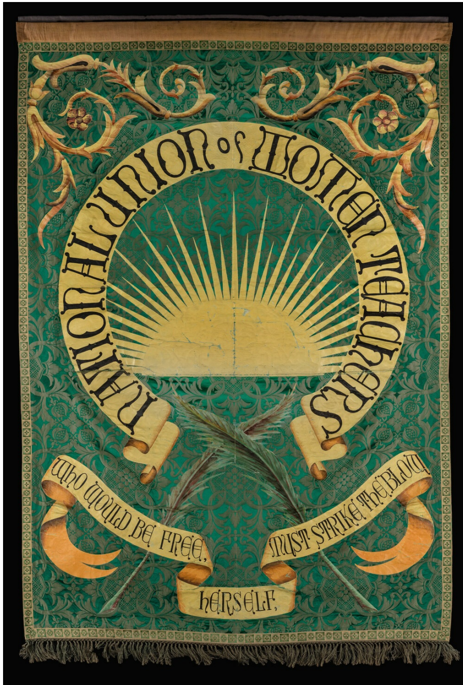
Fig. 7 Banner for the National Union of Women Teachers, by Mary Lowndes. 1908. (exh. De La Warr Pavilion, Bexhill-on-Sea).