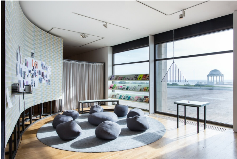
Fig. 3 Installation view of Still I Rise: Feminisms, Gender, Resistance at the De La Warr Pavilion, Bexhill-on-Sea, 2019. (Photograph Rob Harris).