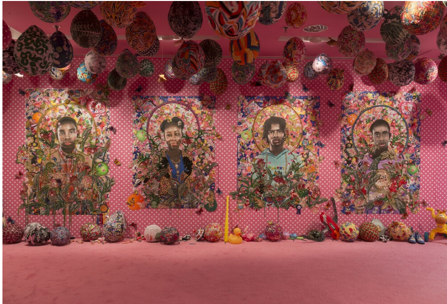
Fig. 1 Installation view of ...when they grow up... at the Studio Museum in Harlem, New York, 2016.

In the five-panel work ...and the dew cracks the earth, in five acts of lamentation...between the cuts...beneath the leaves...below the soil FIG.2 , branching vines, feathered butterflies and paper flowers – some of which represent poisonous specimens – stand out against a white background. More ‘living wall’ than painting, each panel consists of lush overgrowth that envelops a human presence which slowly becomes apparent: a trio of headless female figures FIG.3 ; floating body parts; a disembodied head poking out from a bouquet of peonies; an outstretched hand resting on a fern. These limbs do not imply a group of children hiding in the garden – a light-hearted game of hide-and-seek – so much as a single dismembered child. The viewer feels an urge to fit together the chopped limbs into a coherent body, a mental exercise that is as gruesome as it is futile. Compiling incompatible fragments and persuading the viewer to assemble them is emblematic of Patterson’s approach to representation; she explodes the puzzle instead of solving it.