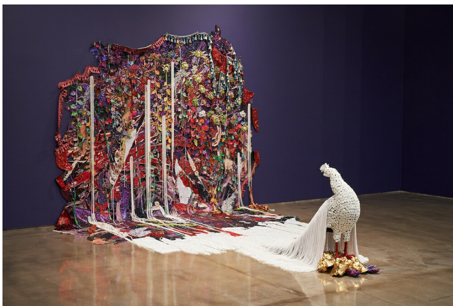
Fig. 4 when the land is in plumage...a peacock is in molting by Ebony G. Patterson. 2020. Glitter, glue, beads, plaster, conch shells, gold leaf, porcelain, paint, trimmings, jewellery, embellishments, fabric, jacquard tapestry and paraffin wax, 393 by 313 by 274 cm. (Courtesy the artist and Monique Meloche Gallery, Chicago; photograph Impart Photography; exh. Institute of Contemporary Art San José).