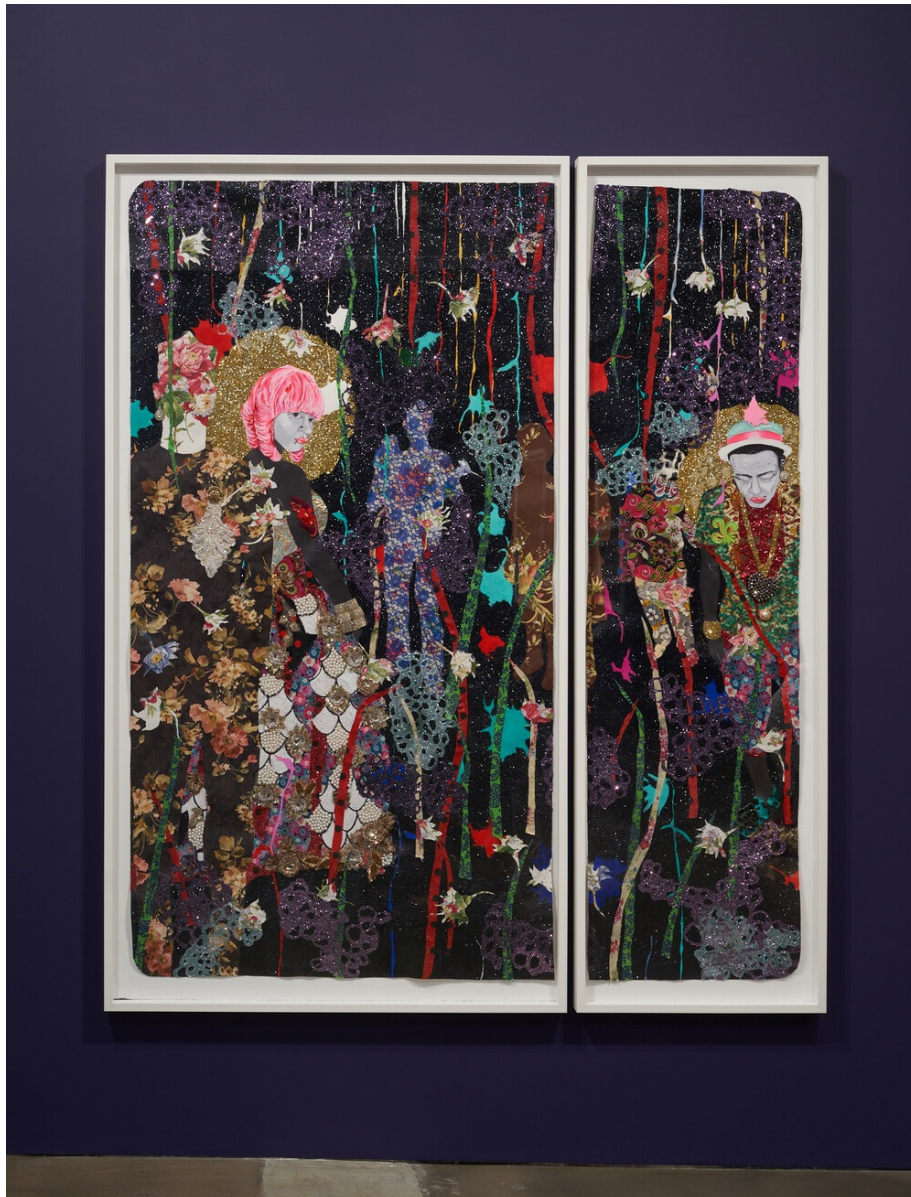
Fig. 7 Duppy Treez , by Ebony G. Patterson. 2013. Mixed media on paper, 199 by 160 cm. (Collection of Josef Vascovitz and Lisa Goodman; courtesy the artist and Monique Meloche Gallery, Chicago; photograph Impart Photography; exh. Institute of Contemporary Art San José).