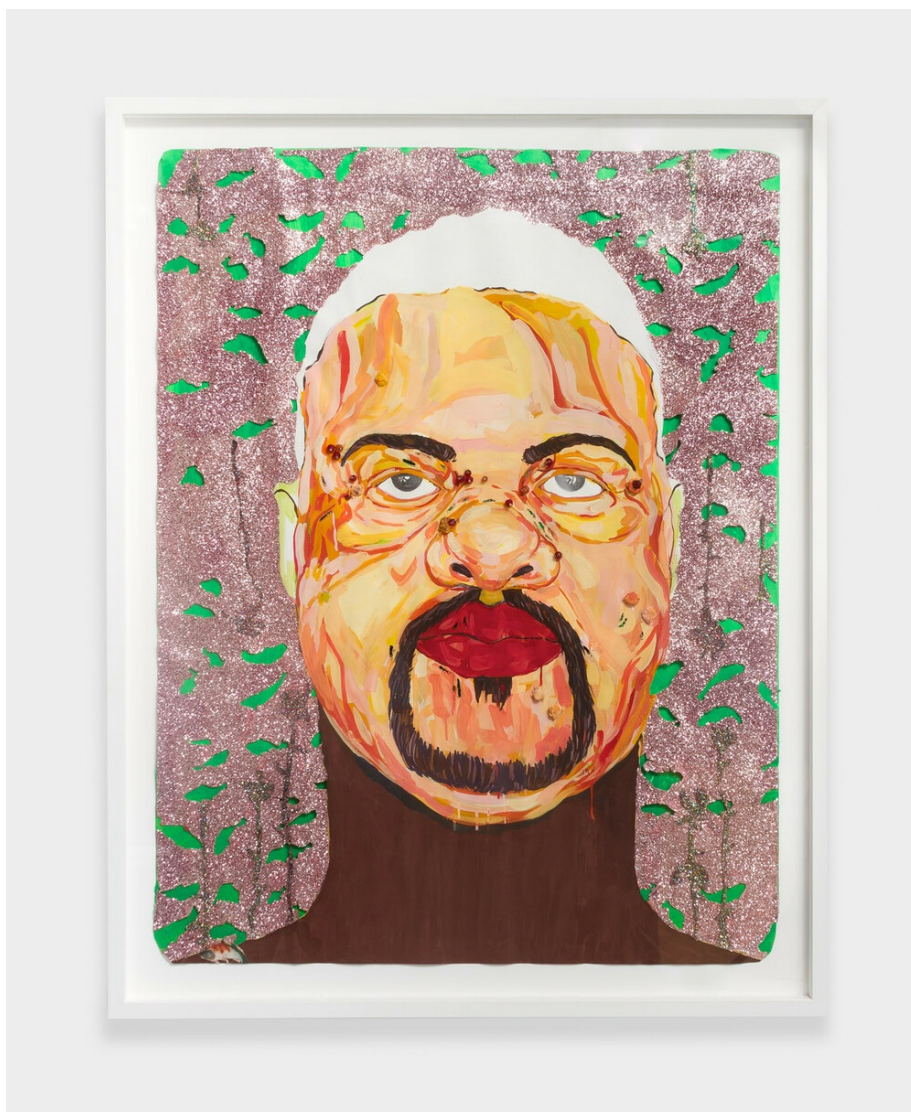
Fig. 6 Untitled IX from Gangstas for Life , by Ebony G. Patterson. 2008. Mixed media on hand-cut paper, 124.5 by 97.8 cm. (Courtesy the artist and Monique Meloche Gallery, Chicago; exh. Institute of Contemporary Art San José).

Chicago; photograph Impart Photography; exh. Institute of Contemporary Art San José).