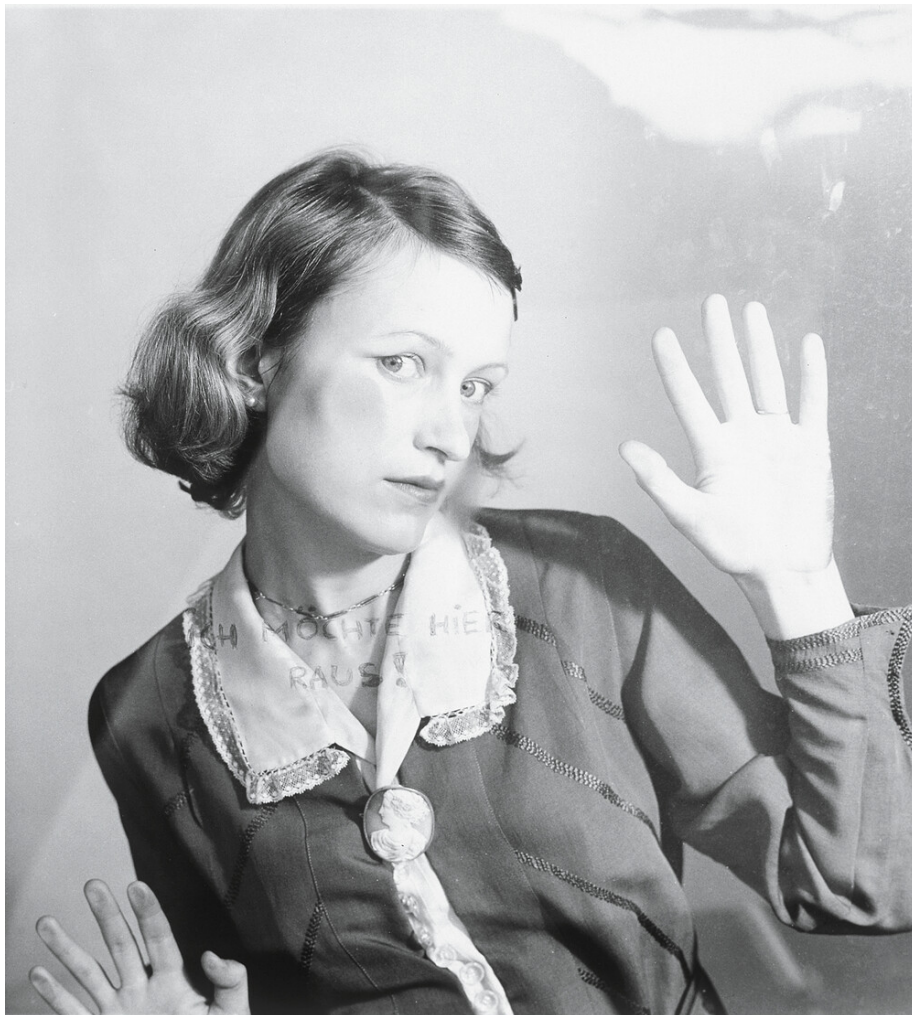
Fig. 1 Ich möchte hier raus! ( I Want Out of Here! ), by Birgit Jürgenssen. 1976. Black-and-white photograph, 40 by 30 cm. (© Estate Birgit Jürgenssen; VERBUND COLLECTION, Vienna; courtesy Galerie Hubert Winter, Vienna; Bildrecht, Vienna; exh. Parc des Ateliers, Arles).

Beauty / Female Body'; 'Female Sexuality'; and 'Identity / Role-Play'. The first of these sections opens the exhibition with I Want Out of Here! FIG.1 by Birgit Jürgenssen (1949–2003), a photographic self-portrait of the artist pressing her face and hands against a pane of glass, across which the titular words are written in German. A similar manifestation of confinement and escape appears in other works, such as a photograph from the series Untitled (Glass on Body Imprints) (1972/1997/2009) by Ana Mendieta (1948–85), Against the Glass (1982/2019) by Gabriele Stötzer (b.1953) and Poemim (Series A) (1978) by Katalin Ladik (b.1942). These images of pressed female skin reference invisible constraints, evoking the 'glass ceiling' often encountered by women. This challenging of the prison-house of patriarchy threads throughout the exhibition, returning in many works that utilise methods of confinement and restraint, for example, four works from the nets series (1980) by Anneke Barger (b.1939) and all eight of the Isolamento sequence FIG.2 by Renate Eisenegger (b.1949).