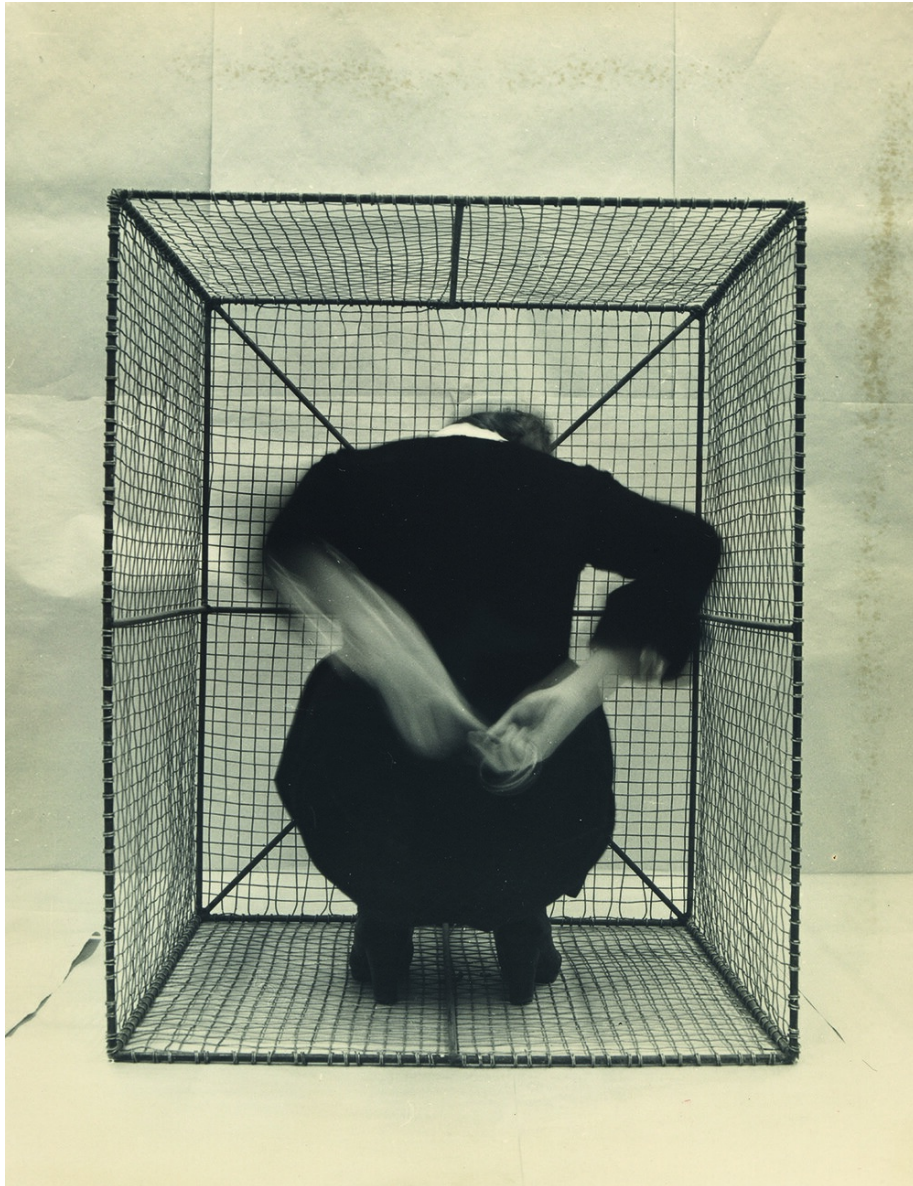
Fig. 3 Individual Mythology. Cage , by Orshi Drozdik. 1976. Gelatin silver print, 27.4 by 21.4 cm. (© the artist; VERBUND COLLECTION, Vienna; courtesy Knoll Galerie, Vienna; exh. Parc des Ateliers, Arles).