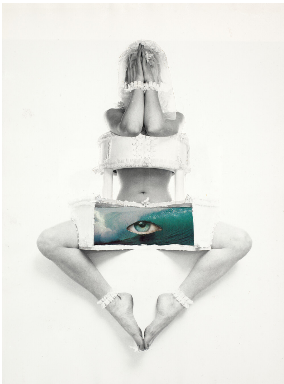
Fig. 5 ICU, Eye Sea You, I See You from the series Bride's Cake Series , by Penny Slinger. 1973. Photocollage, 40.6 by 30.5 cm. (© the artist; VERBUND COLLECTION, Vienna; courtesy Blum & Poe, Los Angeles; Artists Rights Society, New York; exh. Parc des Ateliers, Arles).