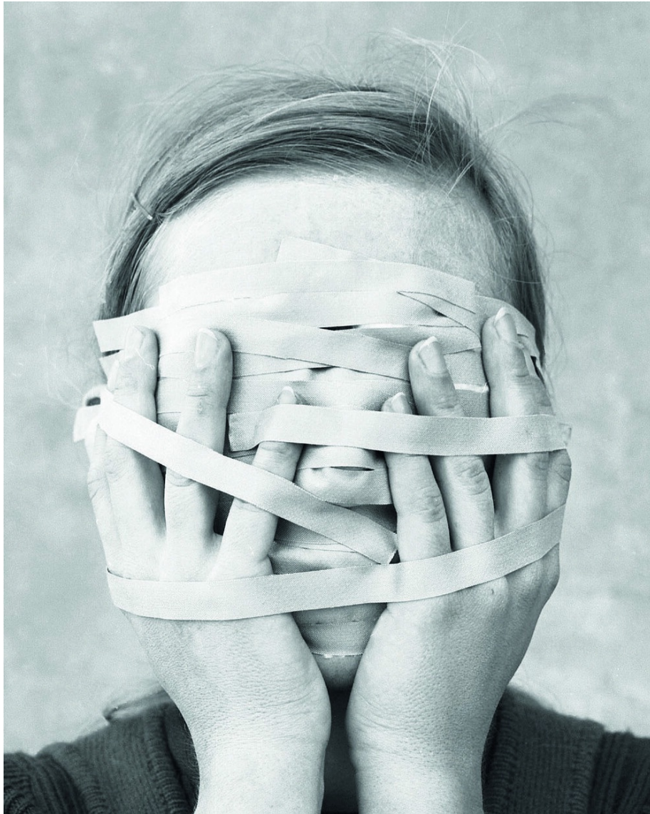
Fig. 2 From the series Isolamento , by Renate Eisenegger. 1972. Black-and-white photograph, 40 by 29.5 cm. (© the artist; VERBUND COLLECTION, Vienna; exh. Parc des Ateliers, Arles).