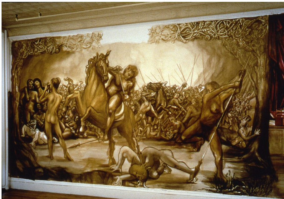
FIG. 1 The Minotaur Hunt , by Nicole Eisenman. 1993. India ink on latex paint on wall, 3 by 4.6 m. (© Nicole Eisenman; courtesy the artist and Hauser & Wirth).

it resistant to exposure and the aesthetic of spectacle. Although, as Eisenman demonstrates, it can easily be magnified to the monumental scale of history painting, while simultaneously subverting the genre through its rejection of the standard rhetoric of permanent dominance. Drawing's associations with process also make more room for observers to enter into dialogue with the work of art and identify their own agency within it. This recalls Michael Rothberg's description of art's potential to cultivate an 'implicated subject' instead of a passive spectator, including the responsibility of privilege, or what it means to have survived or indirectly benefited from political violence. 4 Thus, drawing in particular engages viewers to recognise their own positionality in relation to past and present injustices.