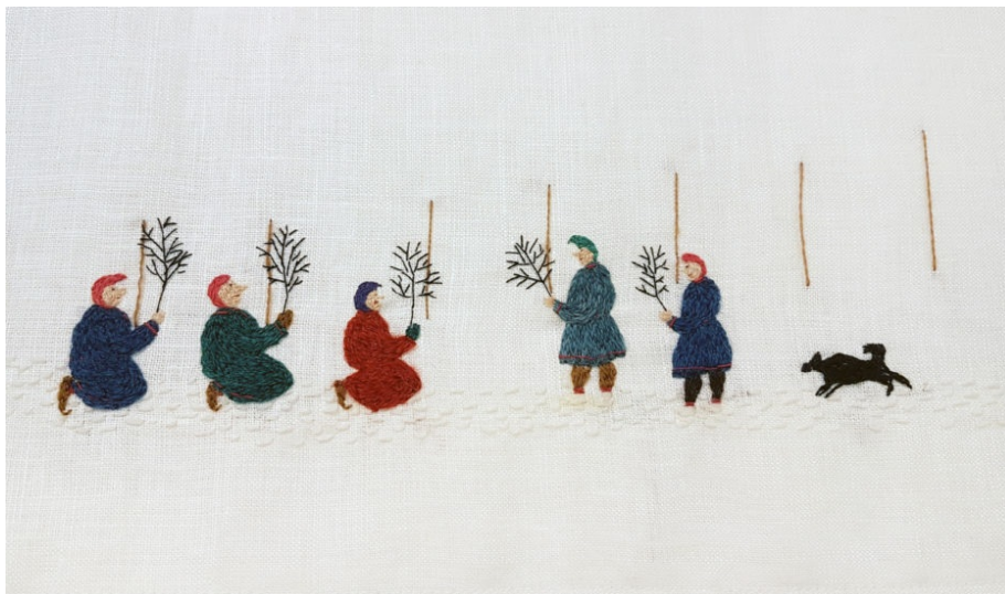
FIG. 9 Detail of Historja (History) , by Britta Marakatt-Labba. 2007. Embroidery on linen.

Marakatt-Labba subverts patriarchal and colonial representations of history by inserting her work into a genealogy that recalls the legacies of Sámi duodji (traditional handicraft) and Indigenous traditions of feminine power. For example, Historja foregrounds the image of the ládjogaphir FIG. 9, a red horn-shaped hat that is traditionally associated with Sámi sovereignty and feminine authority in Sápmi. The diminutive scale of her figures and goddesses wearing the ládjogaphir subvert patriarchal historical representations in such landmark examples of narrative textile art as the Bayeux Tapestry, which depicts a scene of battle in the European tradition. Tone Kristine Thørring Tingvoll observes that instead of the hero William the Conqueror, Historja centres the Samí people and their shared culture rather than any sovereign leader. 51