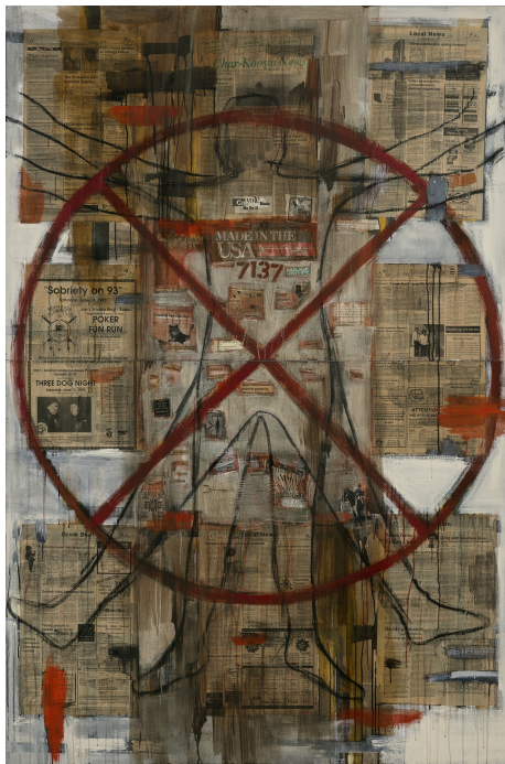
FIG. 3 The Red Mean: Self-Portrait , by Jaune Quick-to-See-Smith. 1993. Acrylic, newspaper collage, shellac and mixed media on canvas, 228 by 152 cm. (Smith College)

In The Red Mean FIG. 3, Jaune Quick-to-See Smith drew two life-sized outlines of her body in charcoal and overlaid them with a drawing in red paint of a medicine wheel. Smith's form is drawn on layers of newsprint and ephemera, which attest to the day-to-day experience of the Confederated Salish and Kootenai Tribes of the Flathead Reservation, of which she is a member. The work references an interaction with her art professor at Framingham State College twenty years earlier. When looking at Leonardo's Vitruvian Man (c.1490; Gallerie dell'Accademia, Venice), Smith asked the professor about the ideal proportions of the female body; he responded that there were no feminine equivalents. 38 In response to this erasure of her bodily specificity, she draws her own presence as an erasure – one that is doubly negated by the large red 'X' overlaid on it. This form references the medicine wheel, which was originally a Plains Indian symbol of harmony and interconnectedness and is now referenced by Indigenous communities across North America. Smith situates the 'X' over the reproductive centre of her body. The boldness of the thick red lines counter the vulnerability implied by the sketchier boundaries of her form, which recall the chalk outline of a murder victim.