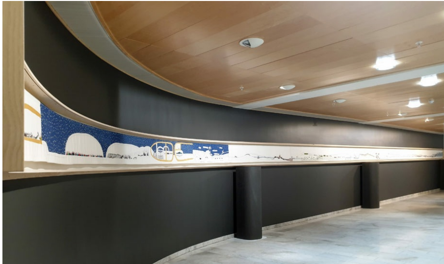
FIG. 6 Historja (History), by Britta Marakatt-Labba. 2007. Embroidery on linen, 0.4 by 23.4 m.

Marakatt-Labba situates Sámi bodies, stories and cosmology at the centre of her work. 47 Her 24 metre-long embroidered mural Historja (History) FIG. 6 became globally renowned after its exhibition in documenta 14 in Athens 2017. It pictures a story of the Sámi people in myth and collective memory, based on both traditional oral narratives and modern written sources. It can be read either right to left or left to right: one beginning FIG. 7 features two goddesses overlooking several groups of sleeping humans, who are about to be created as earthly beings through the arrow of a third goddess, suggesting new generations connected to and guarded by avatars of the past. The other beginning opens with a forest scene, in which the trees are punctuated by small goddess heads. From the trees, wolves, bears and reindeer emerge, reinforcing the interdependency of human culture with nature, as foregrounded in Sámi cosmology. The multiple temporalities and directions of reading the imagery suggest the living presence of the past within the present, as well as the subjective interpretation of historical events.