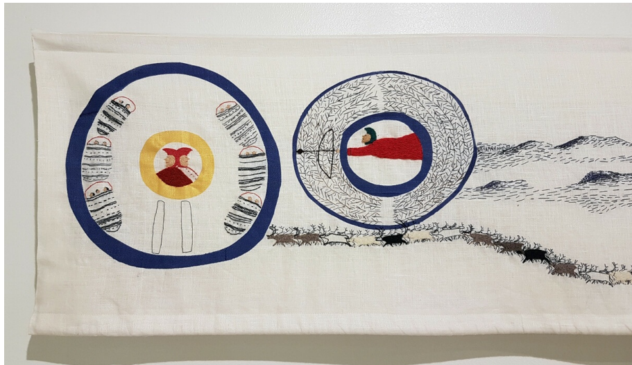
FIG. 7 Detail of Historja (History) , by Britta Marakatt-Labba. 2007. Embroidery on linen. (Courtesy KORO, Oslo; photograph Cathrine Wang).