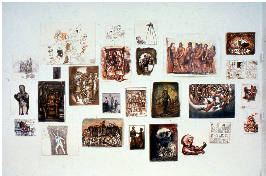
FIG. 2 Installation view of Nicole Eisenman at Jack Tilton Gallery, New York, 1994.

The scene becomes even more complex when one considers the racial identifications that have since come to frame the European heritage of art history. The embodiment of aggression in these nudes – led by a light-skinned figure on horseback with a darker-skinned henchwoman and enacted against two notably whiter minotaur figures – reads simultaneously as a revenge taken against white masculine icons of physical power and a disturbing attack on two monstrous outsiders by a multiracial and multigendered coalition. The racial implications of Eisenman's work have been overshadowed by its critique of gender and sexuality, but its equivocal and humorous redrawing of figures of authority in a carnivalesque scene of gleeful destruction metaphorically tramples any standard of racial or gender superiority by breaking down multiple binary formulas at once.