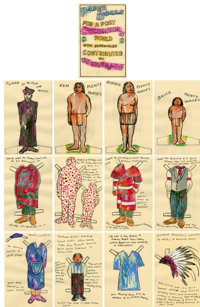
FIG. 4 Paper Dolls for a Post-Columbian World with Ensembles Contributed by the US Government , by Jaune Quick-to-See Smith, 1991–92. Watercolour, pen and pencil on photocopy paper, 13 sheets, each 43 by 28 cm. (Courtesy the artist and Garth Greenan Gallery, New York).

images as timely and spontaneous riffs on a history of colonisation