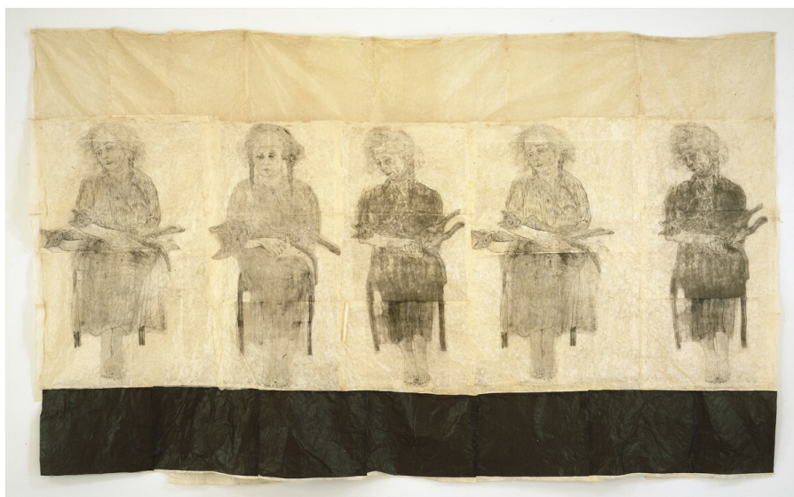
FIG. 5 Pietà , by Kiki Smith. 1999. Ink on paper, 2.3 by 3.8 m. (© Kiki Smith; courtesy Pace Gallery; photograph Ellen Page Wilson).

One can compare Kiki Smith's self-portraits to the way that Jaune Quick-to-See Smith situates herself in the location of the canonical Vitruvian Man , a kind of 'golden mean' of human proportion that proposes the idealised Euro-American male body as the archetype of all human imagery. Both artists redraw the defining imagery of